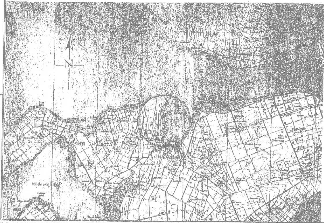
LOCATION PLAN SCALE: 1:25000 @ A1