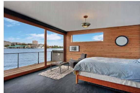
BEDROOM 1 CONCEPT