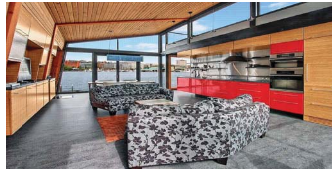
LIVINGROOM / KITCHEN CONCEPT