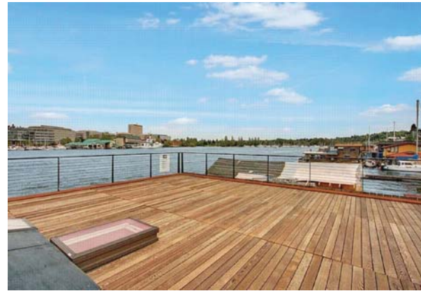
UPPER DECK CONCEPT