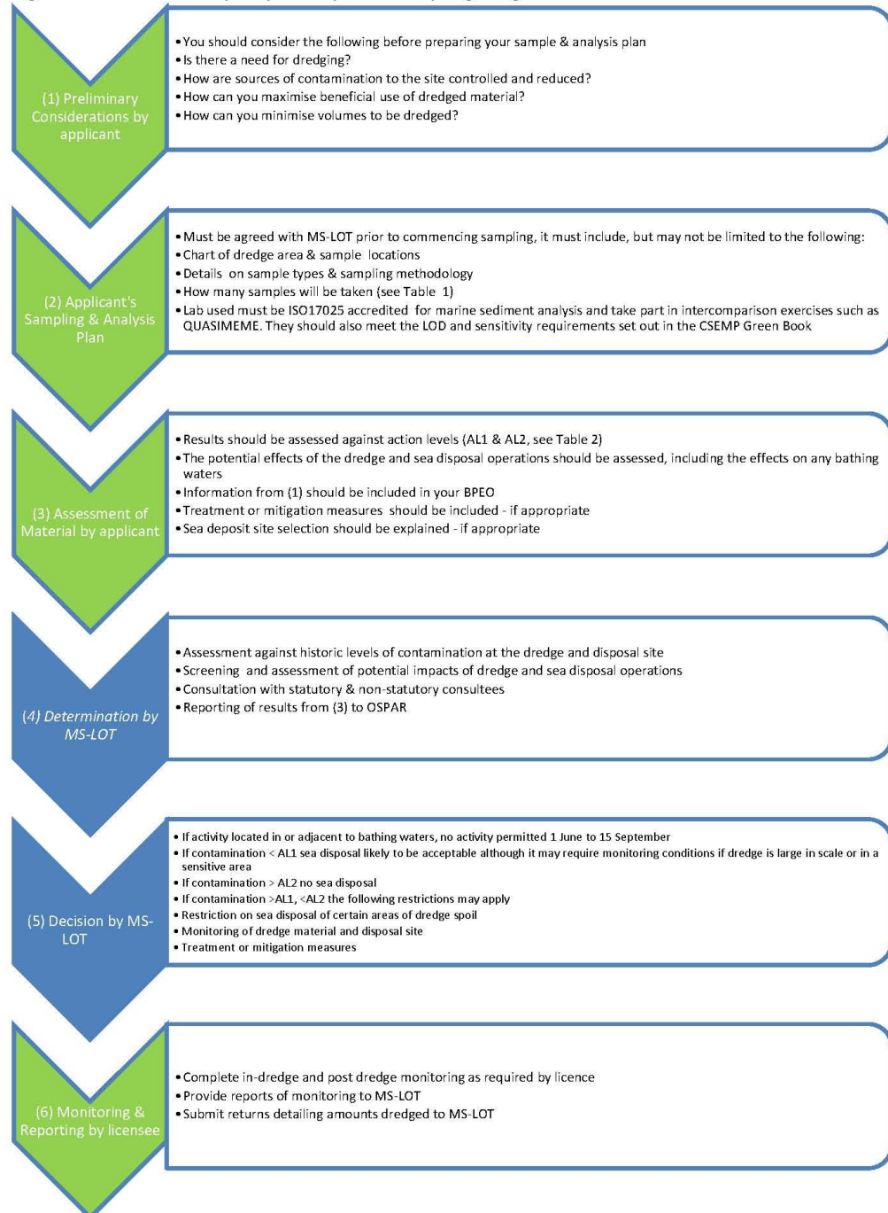
Figure 1 – Process map of pre-disposal sampling stages