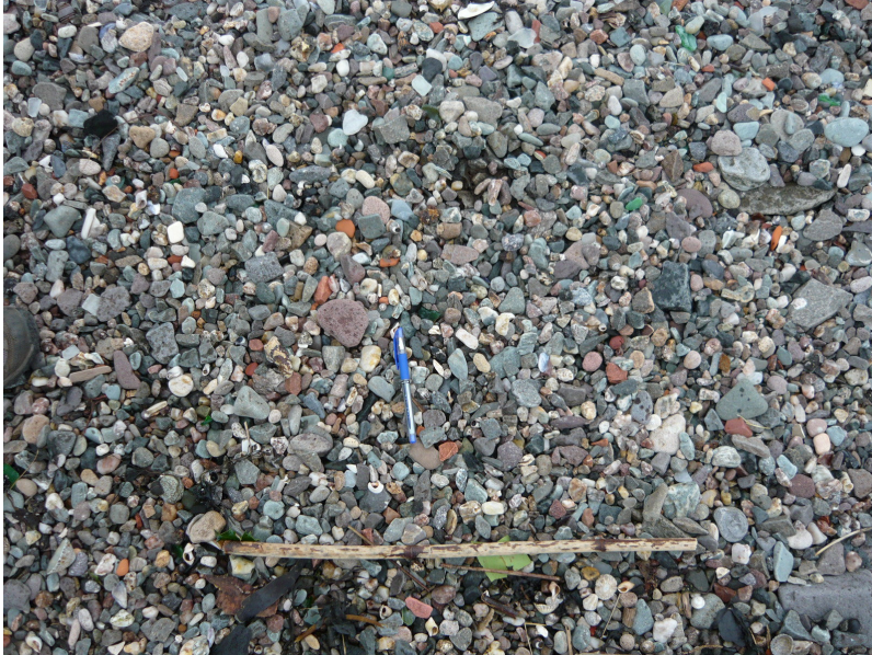
Photo 5: Finer shingle sediment on the lower part of the shingle beach at the eastern side of the site.