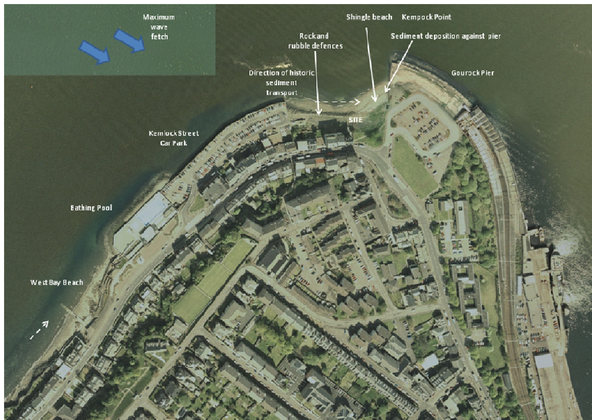
Figure 1: Coastal Processes at site, on annotated aerial photograph of Gourock