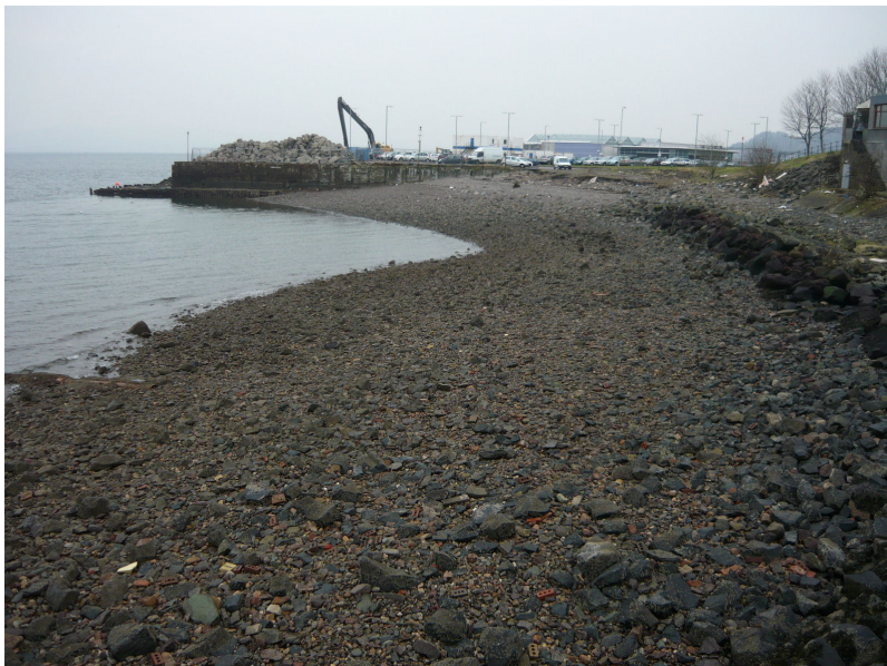
Photo 1: Proposed Development Site, looking to the east from Kempock Street car park