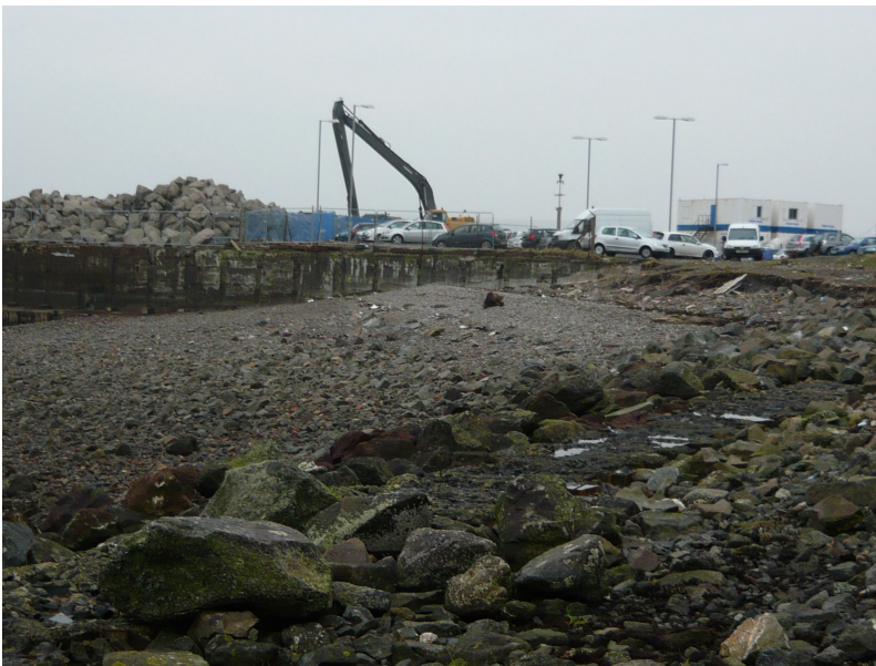
Photo 4: Short section of shingle beach at the eastern side of the site