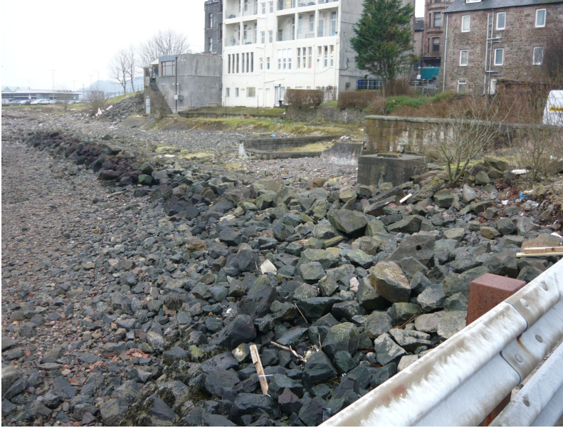
Photo 3: Rocks fronting the old concrete blocks along the western side of the site