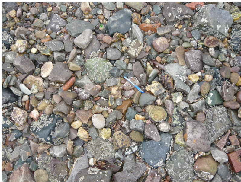
Photo 2: Beach sediment on western side of site (note the barnacle cover)