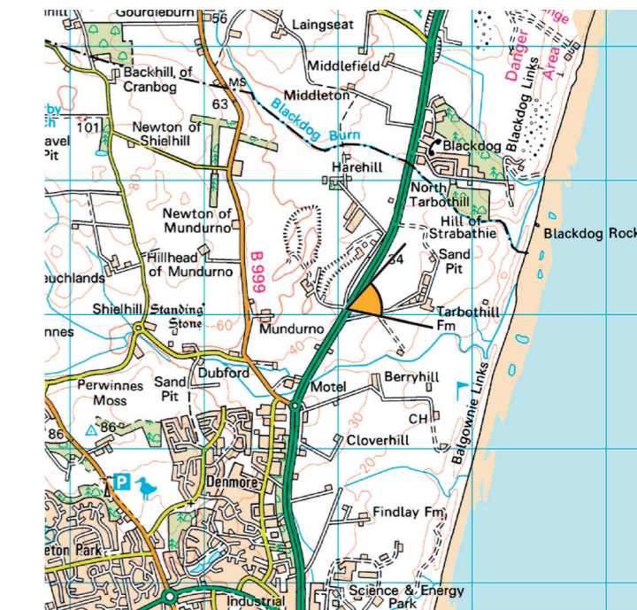
Location Plan - 1:50,000 scale

This map is reproduced from Ordnance Survey material with the permission of Ordnance Survey on behalf of the Controller of Her Majesty's Stationery Office © Crown copyright. Unauthorised reproduction infringes Crown copyright and may lead to prosecution or civil proceedings. Licence number 0100031673 [2011]