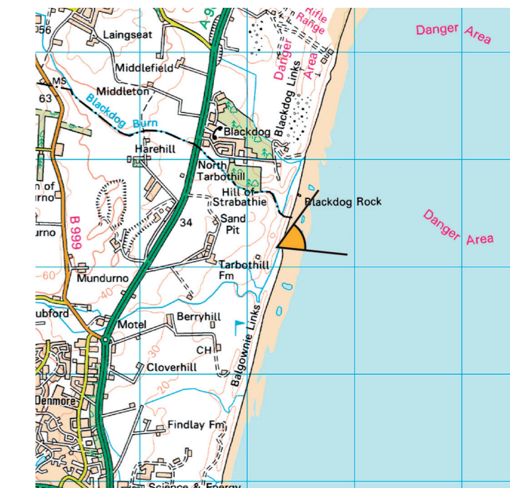
Location Plan - 1:50,000 scale

This map is reproduced from Ordnance Survey material with the permission of Ordnance Survey on behalf of the Controller of Her Majesty's Stationery Office © Crown copyright. Unauthorised reproduction infringes Crown copyright and may lead to prosecution or civil proceedings. Licence number 0100031673 [2011]