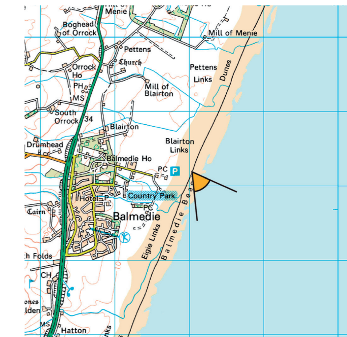
Location Plan - 1:50,000 scale

This map is reproduced from Ordnance Survey material with the permission of Ordnance Survey on behalf of the Controller of Her Majesty's Stationery Office © Crown copyright. Unauthorised reproduction infringes Crown copyright and may lead to prosecution or civil proceedings. Licence number 0100031673 [2011]