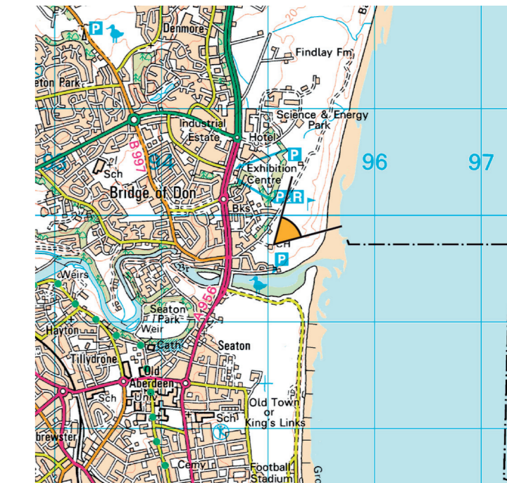
Location Plan - 1:50,000 scale

This map is reproduced from Ordnance Survey material with the permission of Ordnance Survey on behalf of the Controller of Her Majesty's Stationery Office © Crown copyright. Unauthorised reproduction infringes Crown copyright and may lead to prosecution or civil proceedings. Licence number 0100031673 [2011]