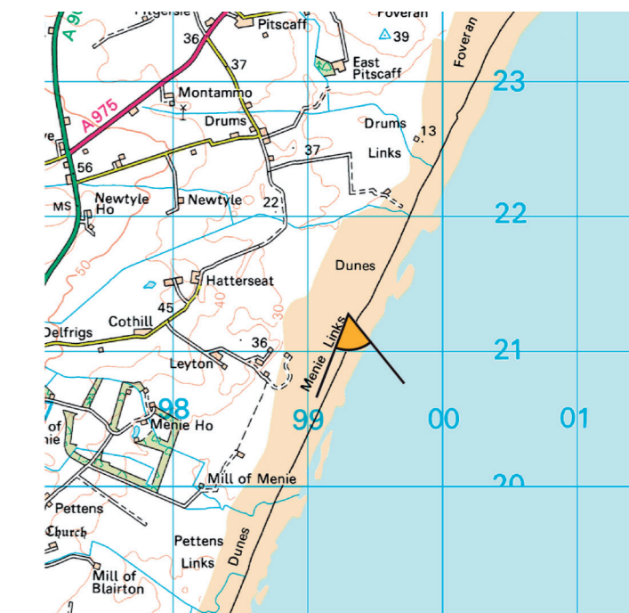
Location Plan - 1:50,000 scale

This map is reproduced from Ordnance Survey material with the permission of Ordnance Survey on behalf of the Controller of Her Majesty's Stationery Office © Crown copyright. Unauthorised reproduction infringes Crown copyright and may lead to prosecution or civil proceedings. Licence number 0100031673 [2011]