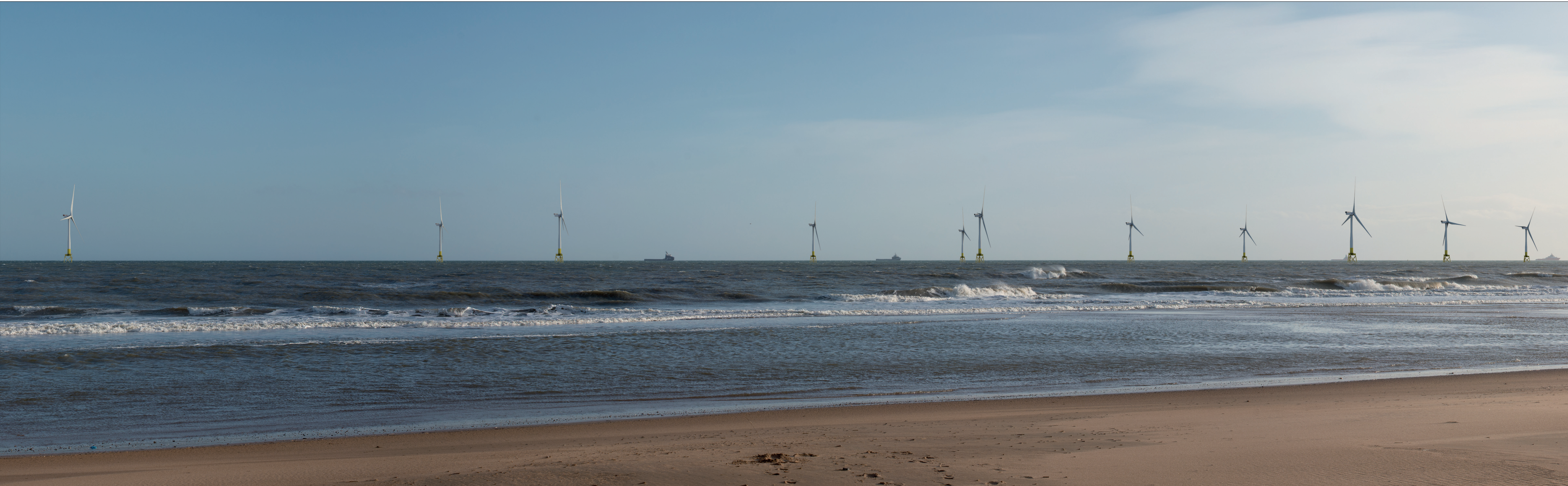
Photomontage illustrating logos

X:\JOBS\5044_EOWDC_CONDITIONS_DISCHARGE\DOCS\VISUAL\FEBRUARY 2017 UPDATE\5044_VP01.INDD