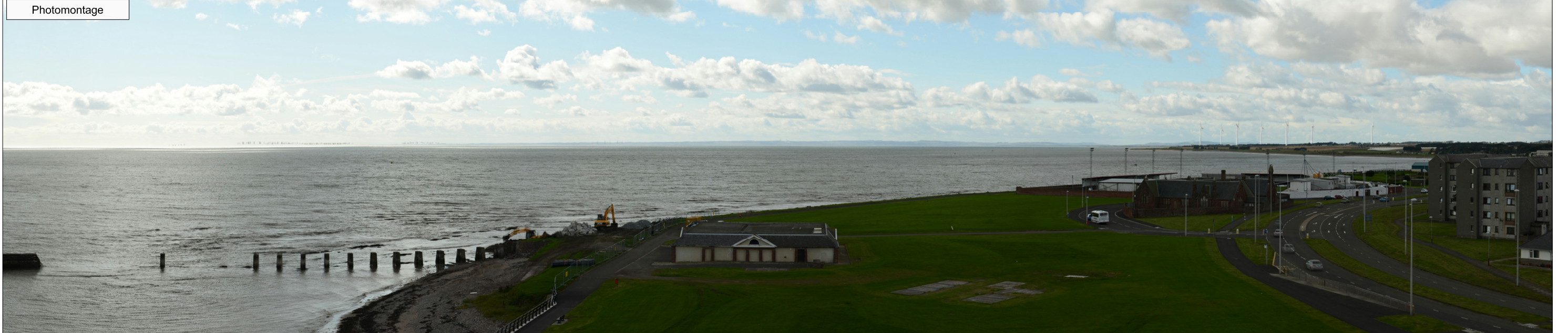
► Viewpoint 7 Arbroath Signal Tower - Cumulative Photomontage