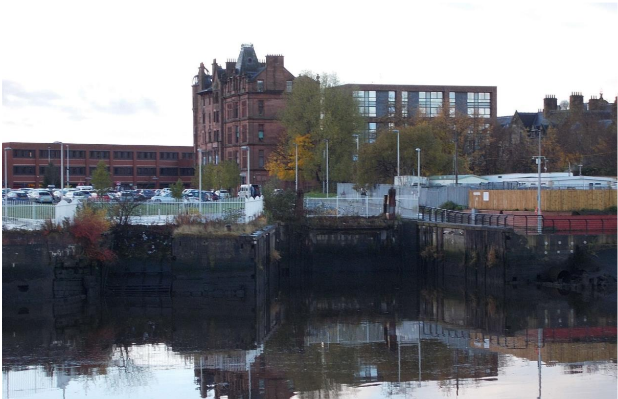
Photo 10 – Proposed south landing - Govan Ferry Inlet, Water Row – Looking south