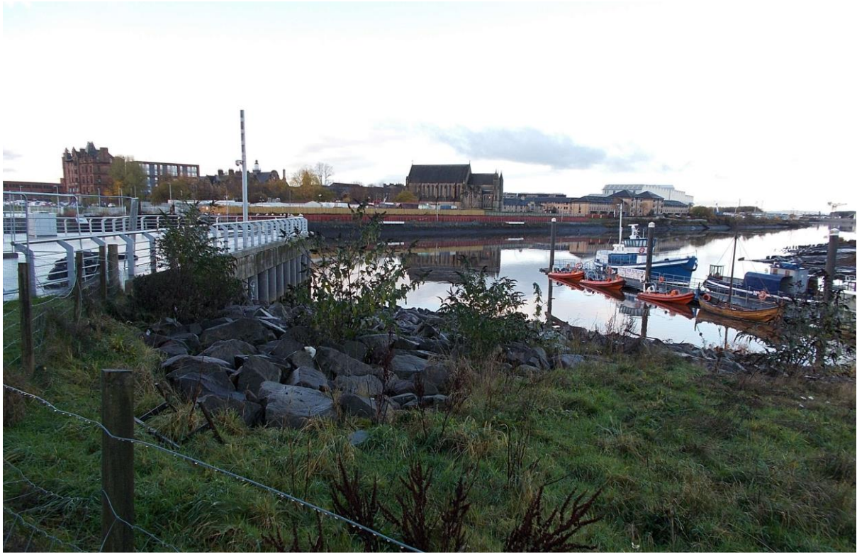
Photo 9 – Location of proposed Pointhouse Quay Extension – Looking south