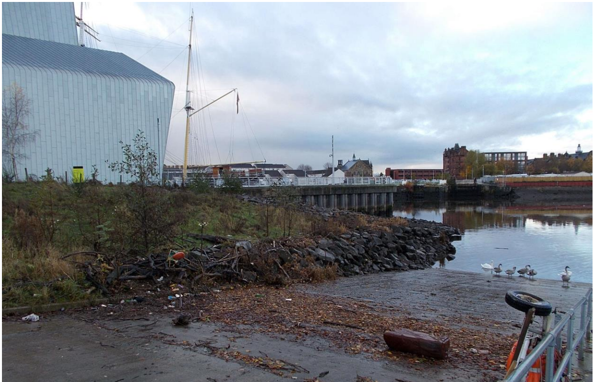
Photo 7 – Pointhouse Quay Slipway at location of proposed Pointhouse Quay Extension