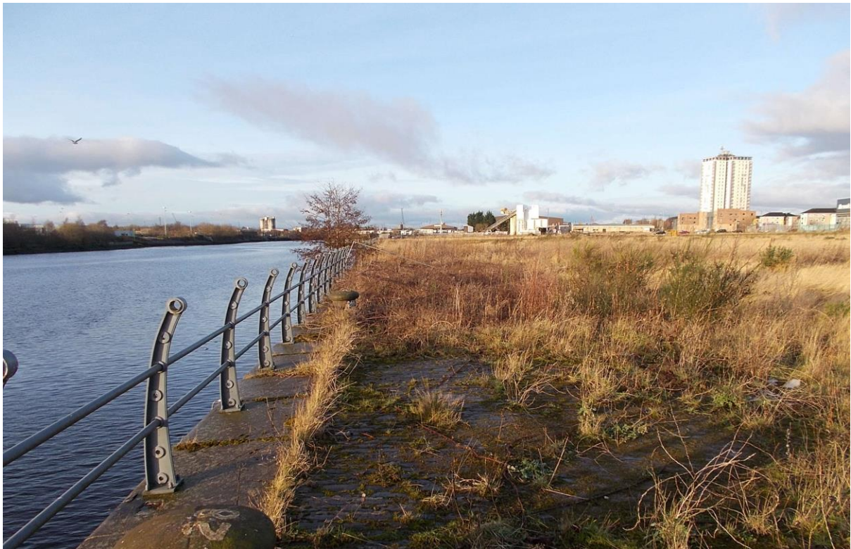
Photo 13 – Proposed Layby Berth – Merkland Quay - Looking west (downstream)