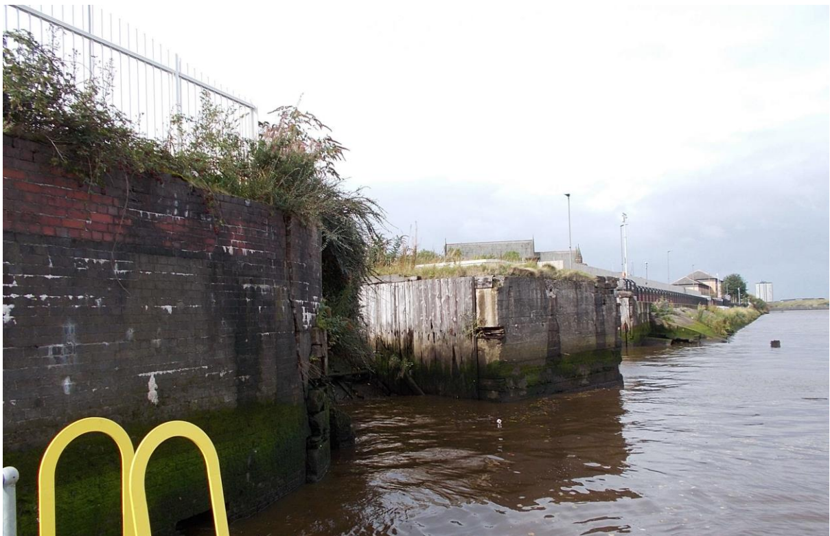
Photo 12 – Proposed south landing - Govan Ferry Inlet, Water Row – Looking west (downstream)