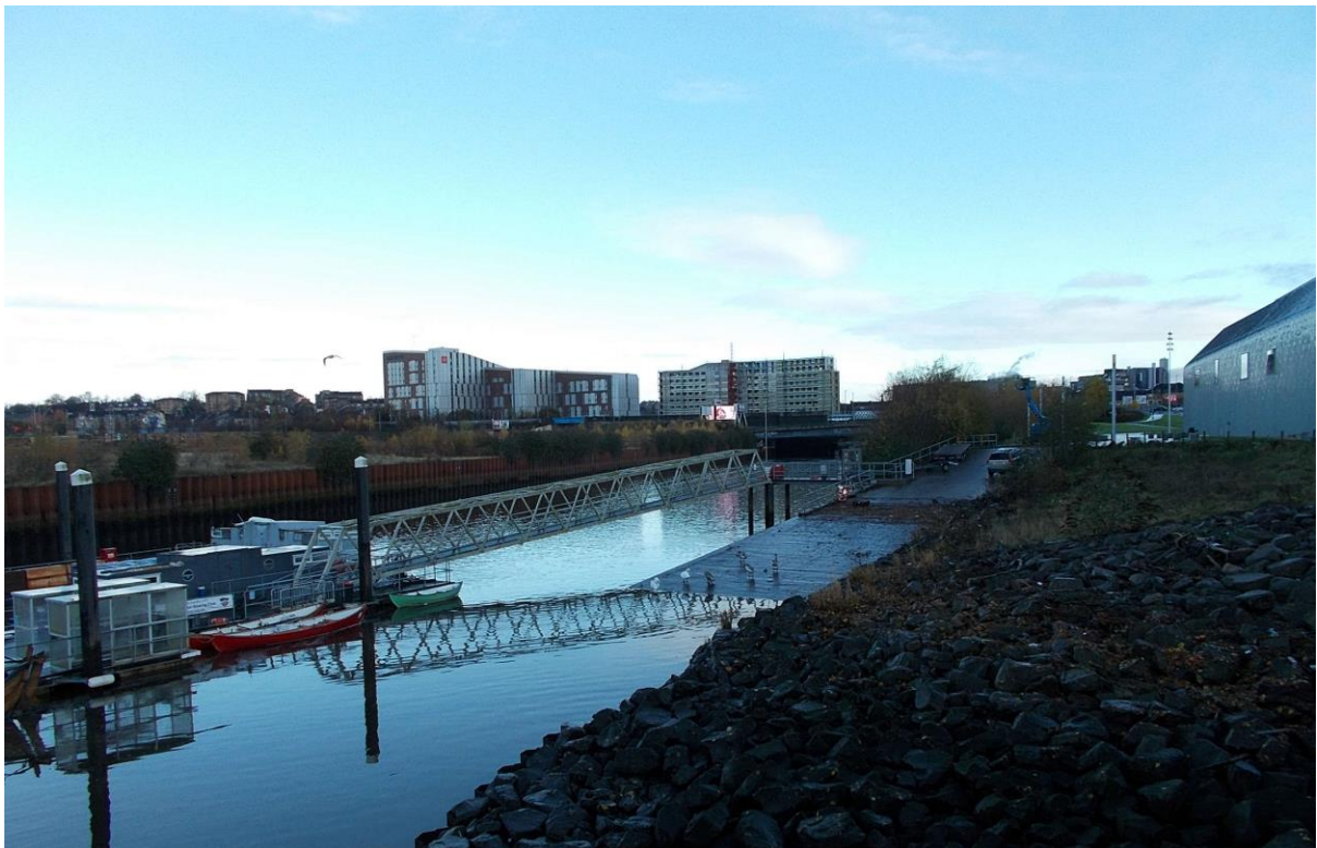
Photo 8 – Pointhouse Quay Slipway at location of proposed Pointhouse Quay Extension