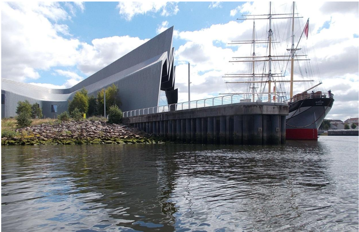
Photo 6 – Location of proposed Pointhouse Quay Extension – Bridge north Landing - Looking east