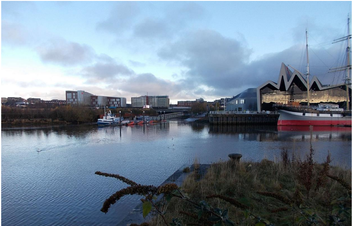
Photo 1 – View north along line of proposed bridge to north landing at Pointhouse Quay