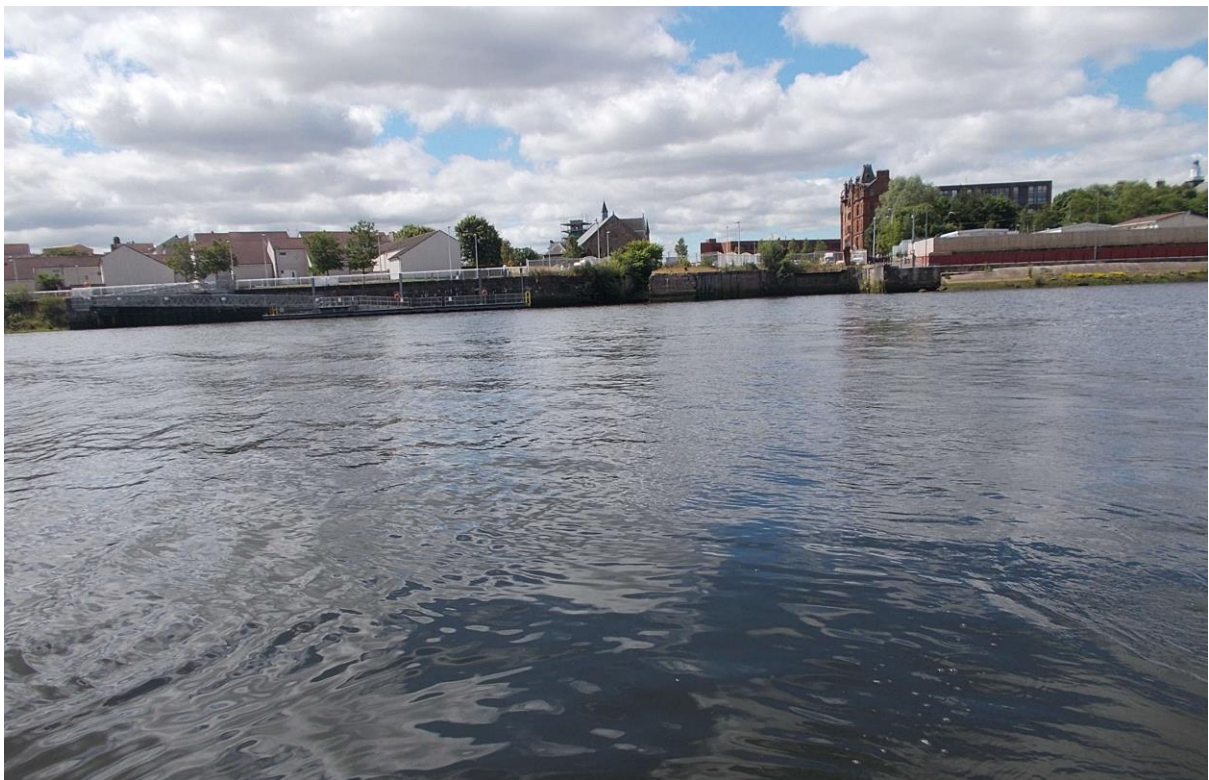
Photo 2 – View south along line of proposed bridge to south landing at Water Row, Govan