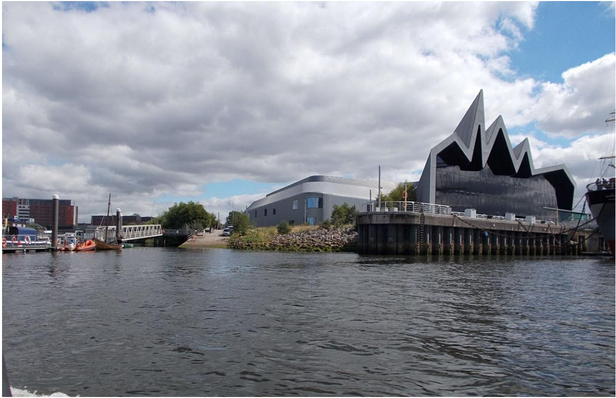
Photo 5 – Location of proposed Pointhouse Quay Extension – Bridge north Landing - Looking north