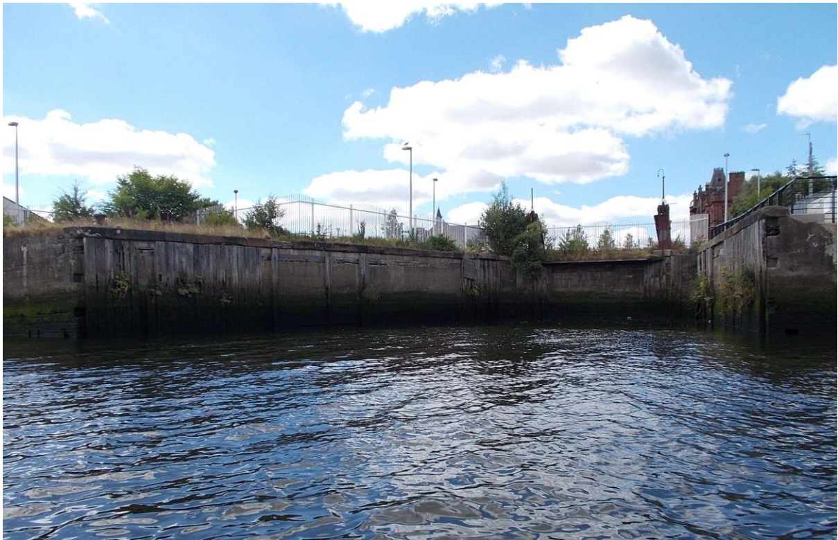
Photo 11 – Proposed south landing - Govan Ferry Inlet, Water Row – Looking south