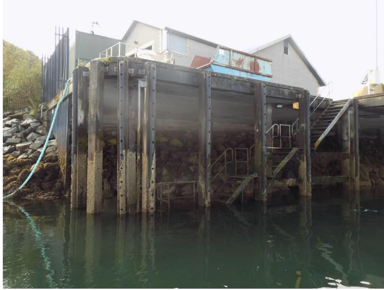
East section of pier