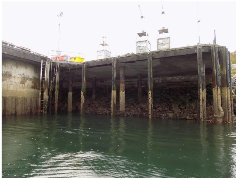
West section of pier