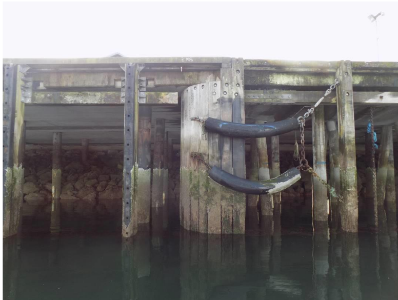
Central section of pier