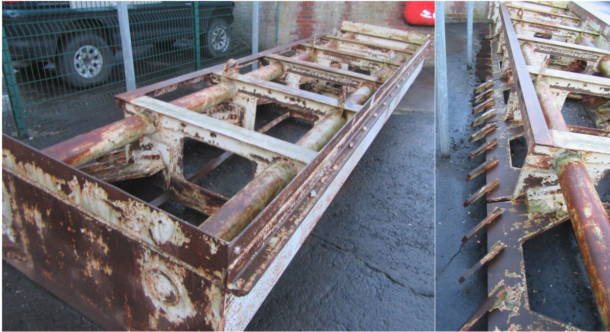
Figure 3. Close up images of the Plough.

This dredging method works by capturing the sediment to be dredged in an open bottom box that is pulled over the area to be dredged. The plough is lowered down to a specific depth on winch wires and is then directed towards the area to be dredged by the tug on which the plough is mounted. As the plough encounters an area that is shallower than the set height of the plough, the cutting blade, on the front of the plough, separates the shallower material from the bed and it accumulates within the plough box. When the plough passes out of the area to be dredged and into deeper water, the material accumulated in the plough box drops out. The plough is then raised and the tug is re-positioned on the outer side of the bar to repeat the process. By repeating this process many times the available depth, over the bar, will be gradually increased and the deeper water immediately inside the harbour will be progressively filled. The process is repeated until the required depth (-1.5mCD) is achieved, at which point the dredging process will be completed.