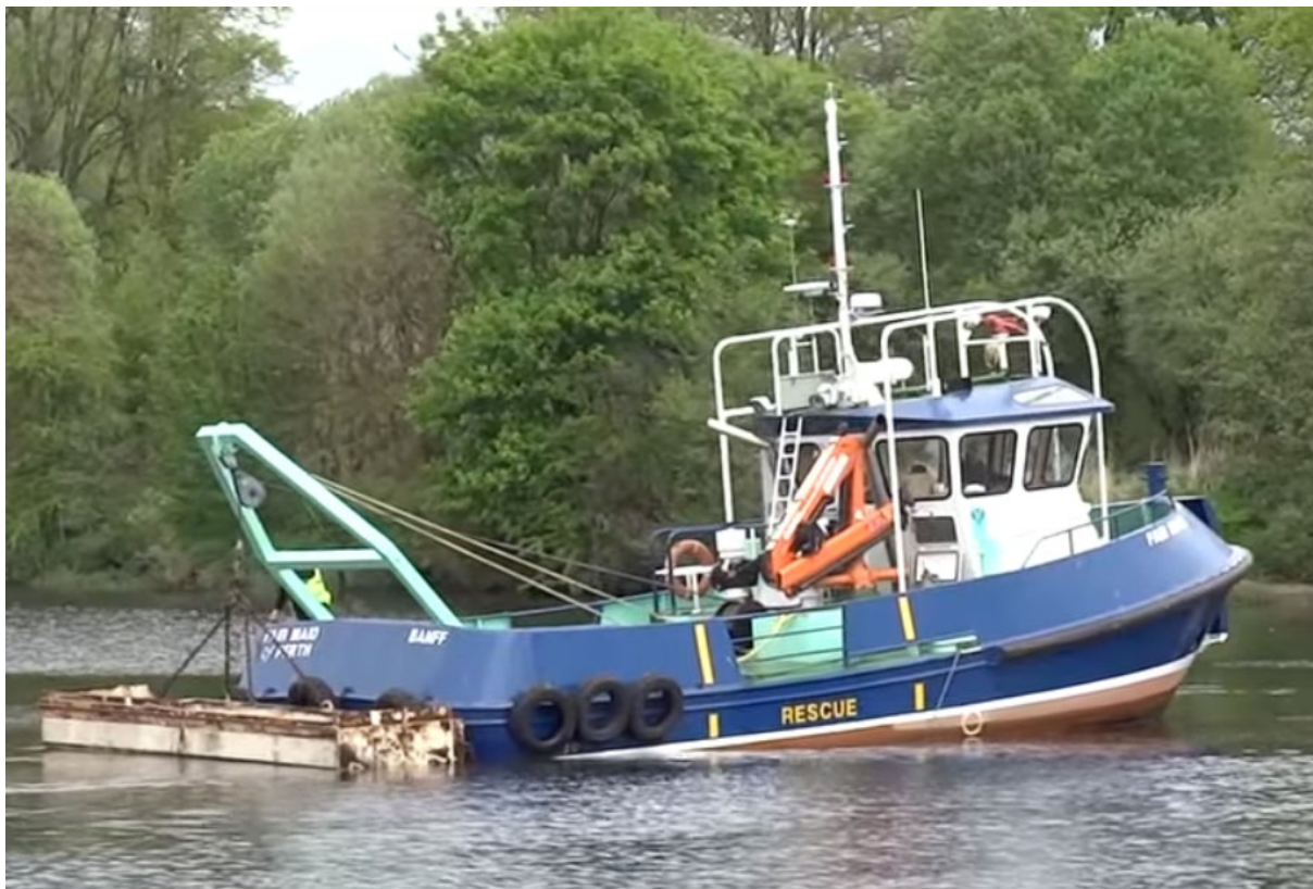
Figure 2. Plough fitted to the back of a suitable tug. The plough is lowered and raised by a winch running over the 'A' frame.

It is proposed to carry out the dredging by relocating material from the bar into the deeper areas of the harbour. This will be achieved using a plough (see figures 2 and 3).