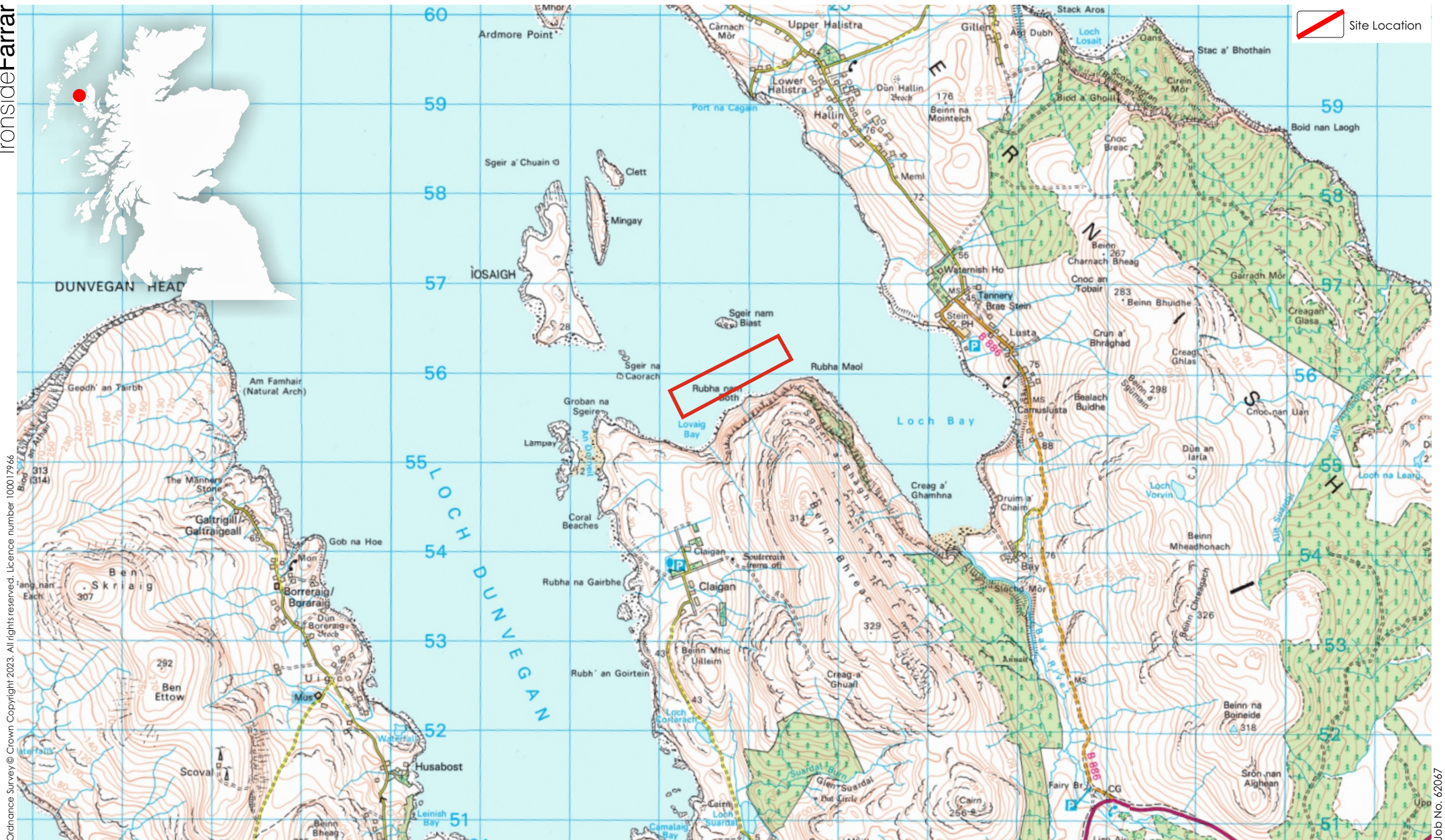
FIGURE 1 LOCATION PLAN