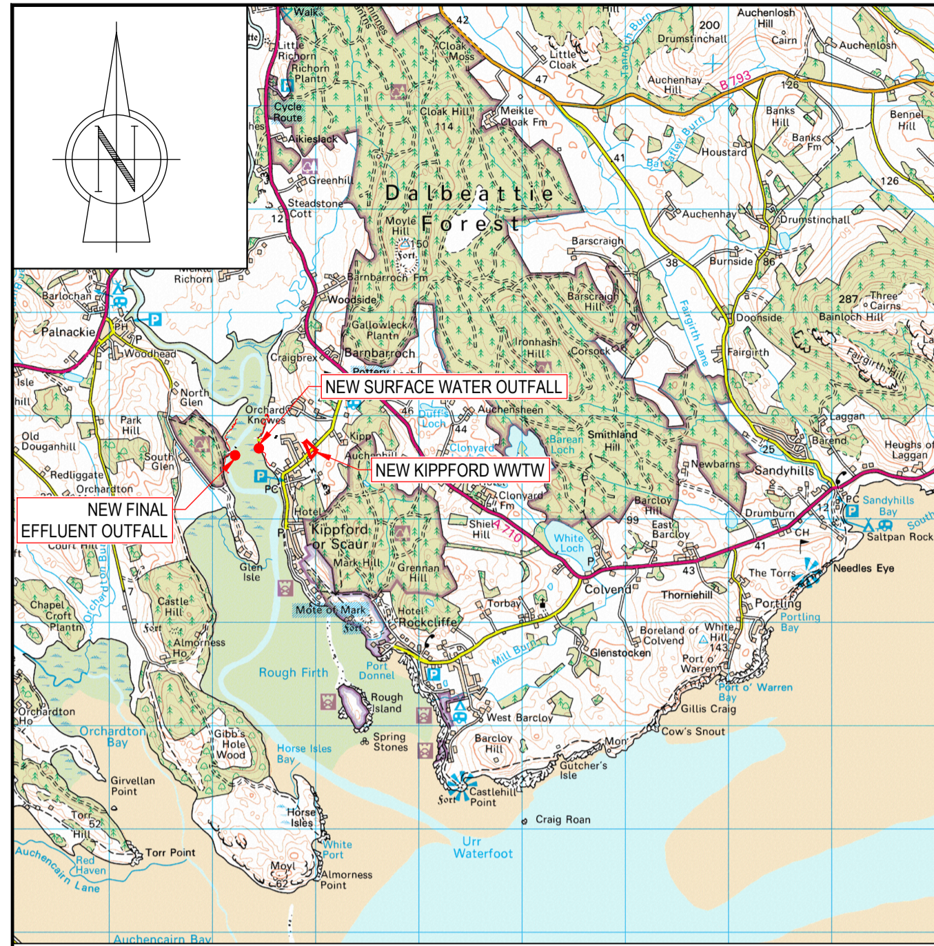
LOCATION PLAN SCALE 1:50,000