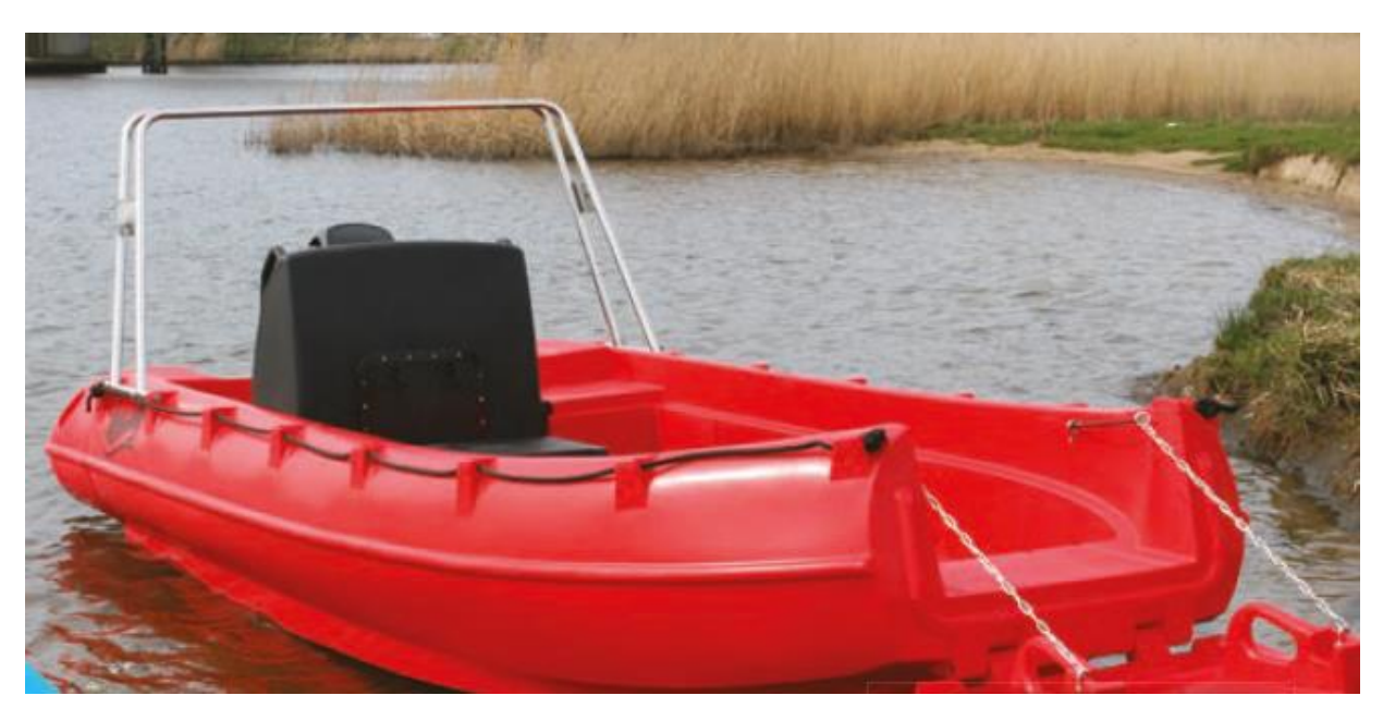
Figure 1 - Proposed or similar RHIB will be used