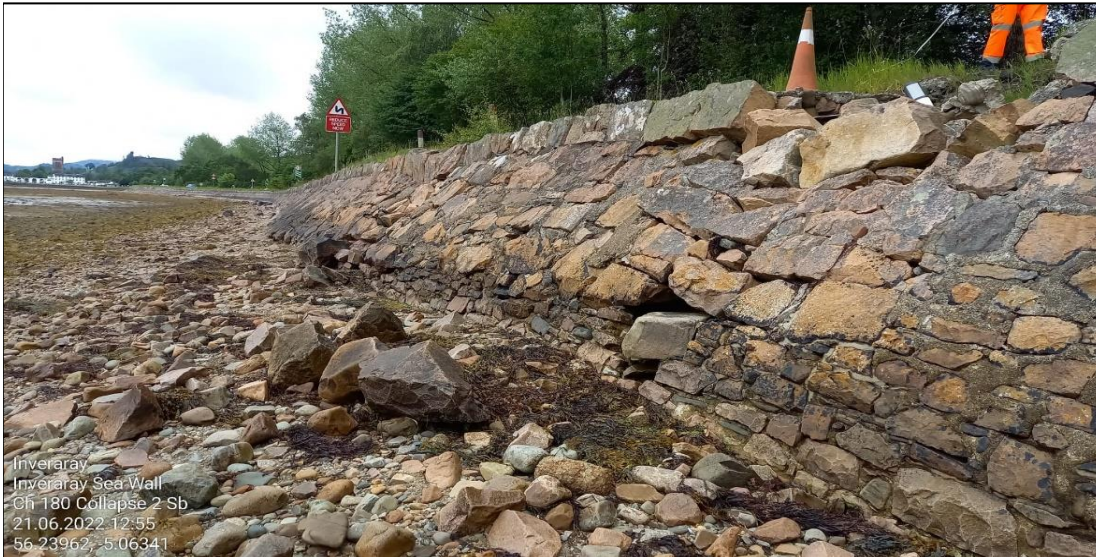
Ch.180 Wall collapse (No.2) - Looking North