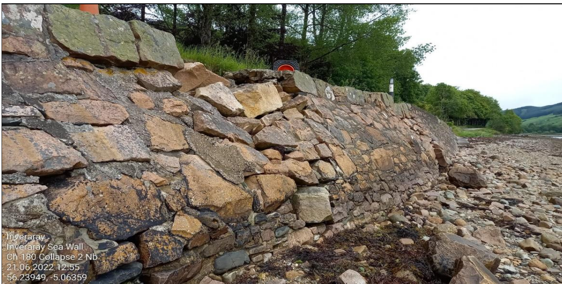
Ch.180 Wall collapse (No.2) - View from Verge