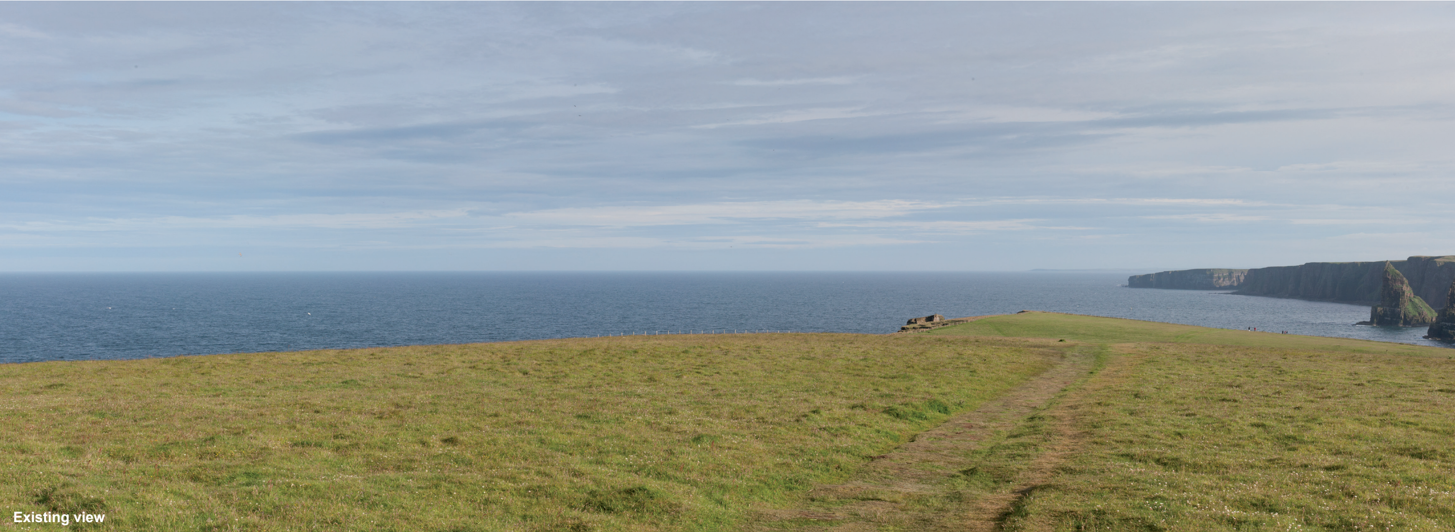
VIEWPOINT 1 - DUNCANSBY HEAD Figure 4c

Distance to nearest turbine: 37.0km Camera: Canon EOS-1Ds Mark III Focal length: 50mm Horizontal field of view: 65.5° Camera height: 1.5m Date: 16/07/2015 Time: 19:02