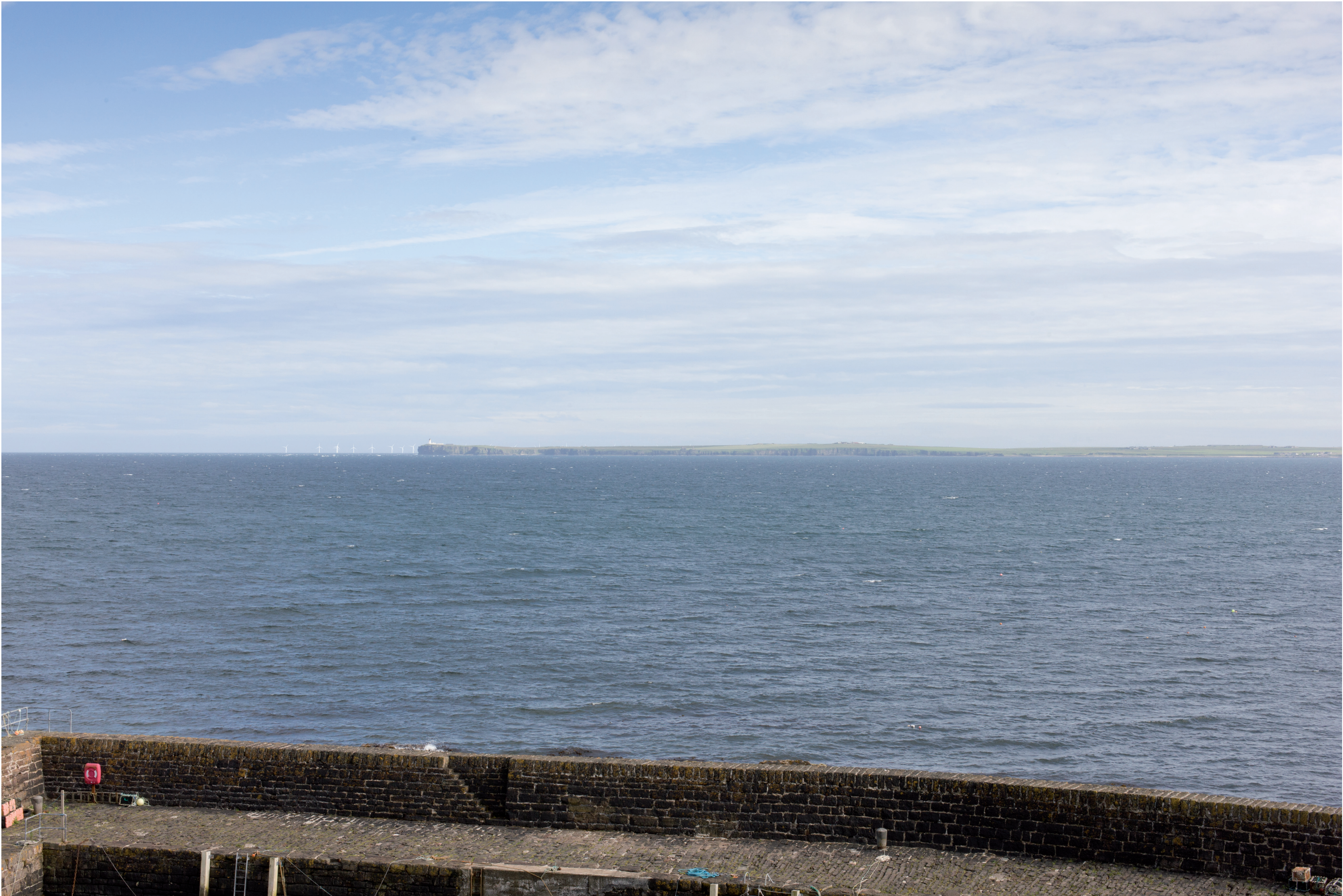
VIEWPOINT 2 - KEISS PIER (NR KEISS HARBOUR HOUSE) Distance to nearest turbine: 27.8km Camera: Canon EOS 5D Mark II Focal length: 50mm Camera height: 1.5m Date: 16/07/2015 Time: 17:35

When viewed at a comfortable arm's length (approx. 500mm), this printed image is representative of our detailed central vision, but is not representative of scale and distance.