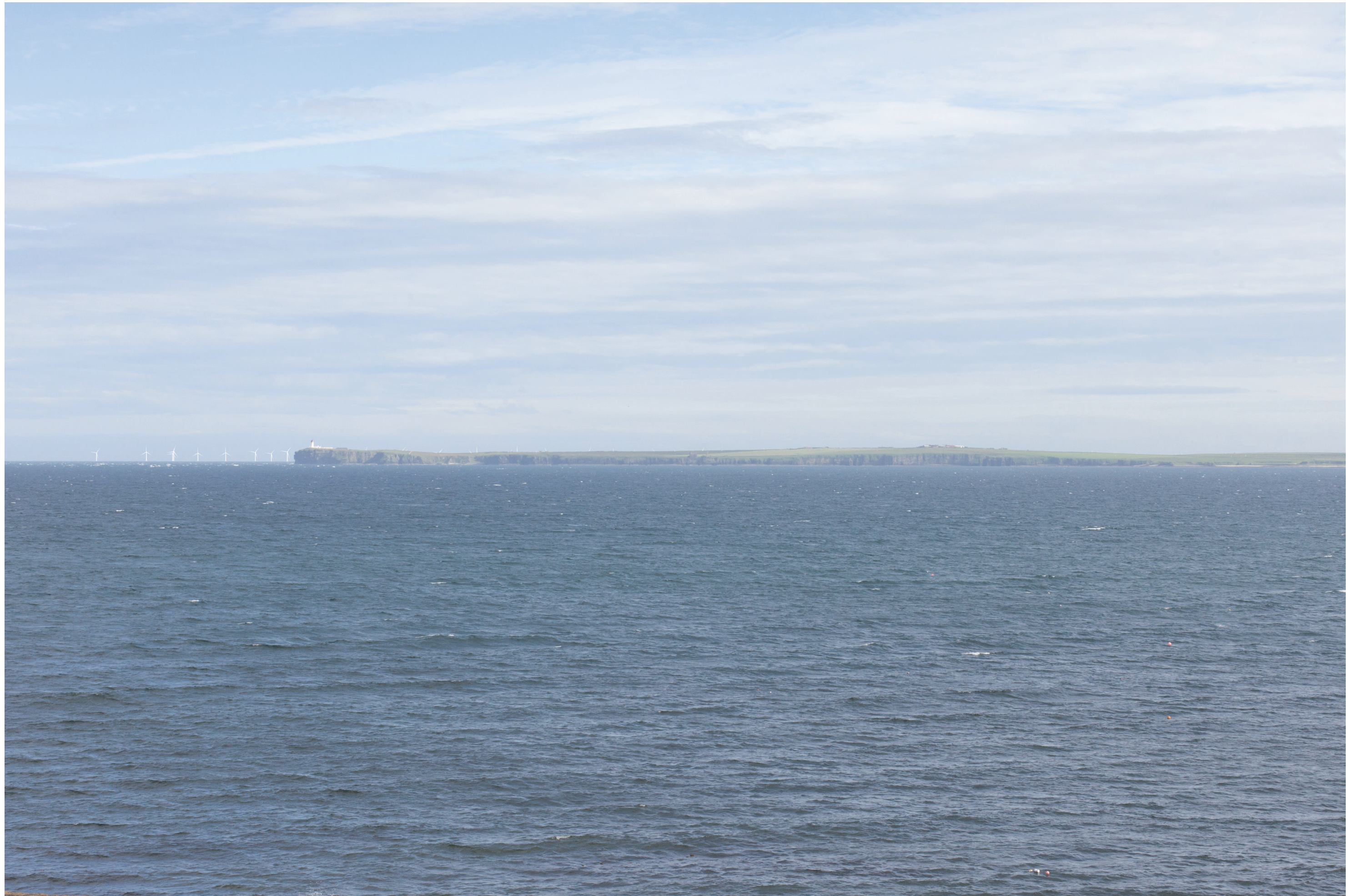
VIEWPOINT 2 - KEISS PIER (NR KEISS HARBOUR HOUSE)

This image should be viewed at a comfortable arm's length (approx. 500mm)