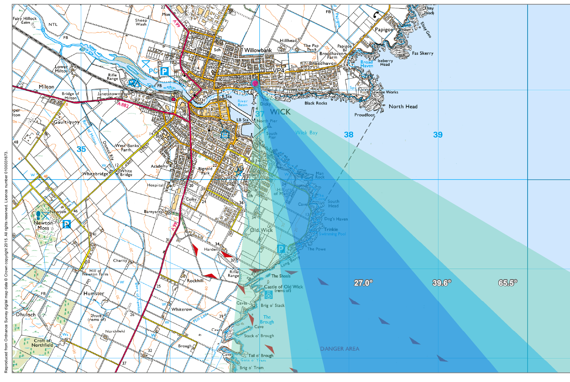
Grid Ref: 336982, 951013 Distance to nearest turbine: 18.7km AOD: 5m

Scalesburn is in the northern part of Wick, north of the harbour and Wick River. The camera point is on the corner forming the junction of The Shore, Port Dunbar and Scalesburn roads. The steep road is a busy road down into town, used by cars and pedestrian shoppers and school children. The camera was set next to a lamppost where a small track leaves the road and runs up beside housing, beside a crash barrier protecting a steep drop down to the harbour area. The camera was set midway between the first two left-hand posts supporting the crash barrier, the tripod straddling the barrier itself.