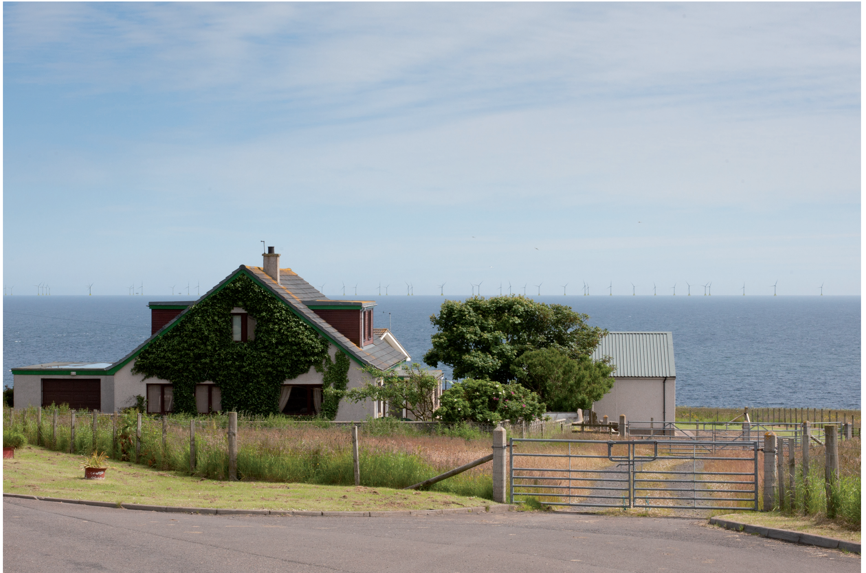
VIEWPOINT 7 - LYBSTER (END OF MAIN STREET)