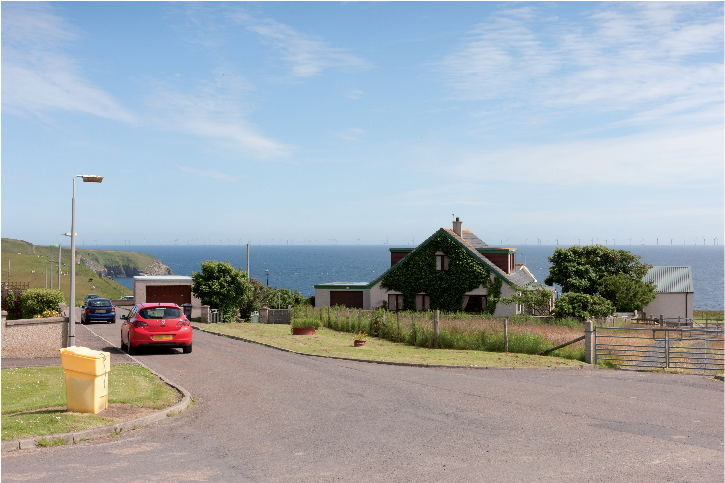
VIEWPOINT 7 - LYBSTER (END OF MAIN STREET)

When viewed at a comfortable arm's length (approx. 500mm), this printed image is representative of our detailed central vision, but is not representative of scale and distance.