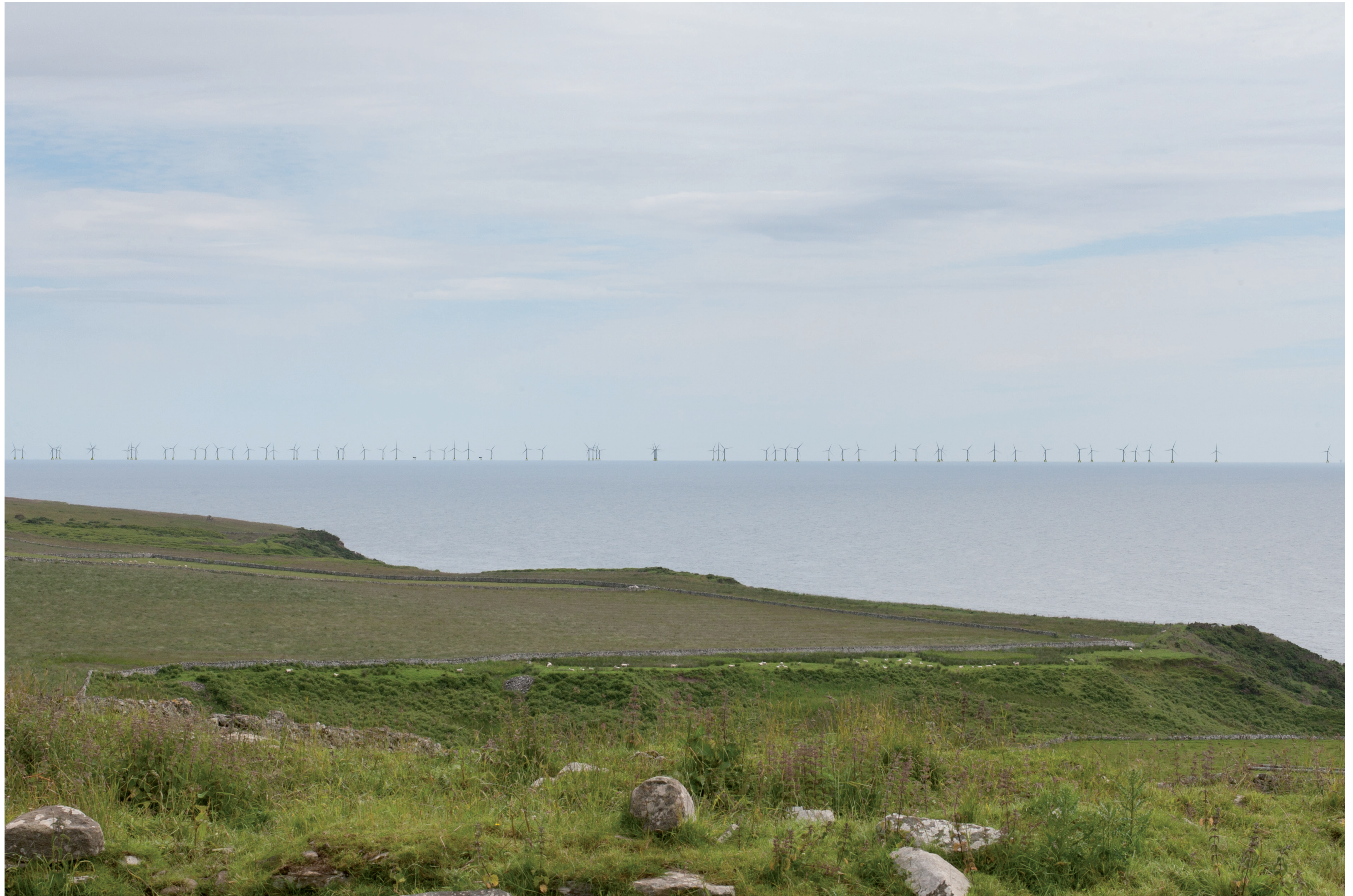
VIEWPOINT 8 - LATHERON (A9) Distance to nearest turbine: 23.0km Camera: Canon EOS 5D Mark II Focal length: 75mm Camera height: 1.5m Date: 16/07/2015 Time: 12:34

This image should be viewed at a comfortable arm's length (approx. 500mm)