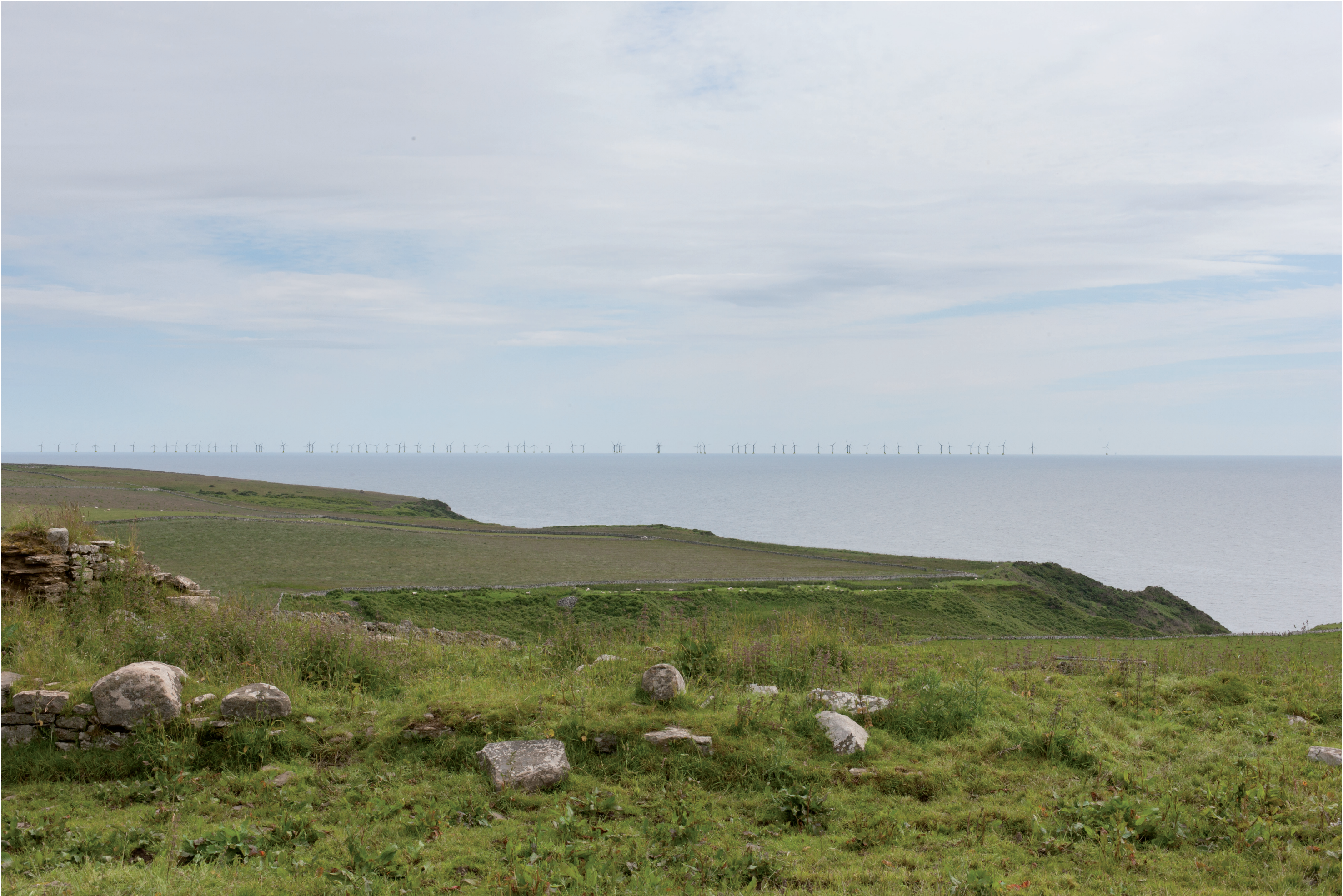
VIEWPOINT 8 - LATHERON (A9)

When viewed at a comfortable arm's length (approx. 500mm), this printed image is representative of our detailed central vision, but is not representative of scale and distance.