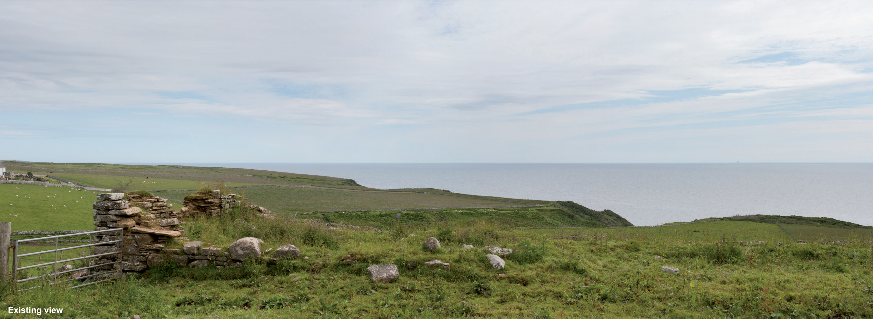
VIEWPOINT 8 - LATHERON (A9) Figure 9c

Distance to nearest turbine: 23.0km Camera: Canon EOS 5D Mark II Focal length: 50mm Horizontal field of view: 65.5° Camera height: 1.5m Date: 16/07/2015 Time: 12:34