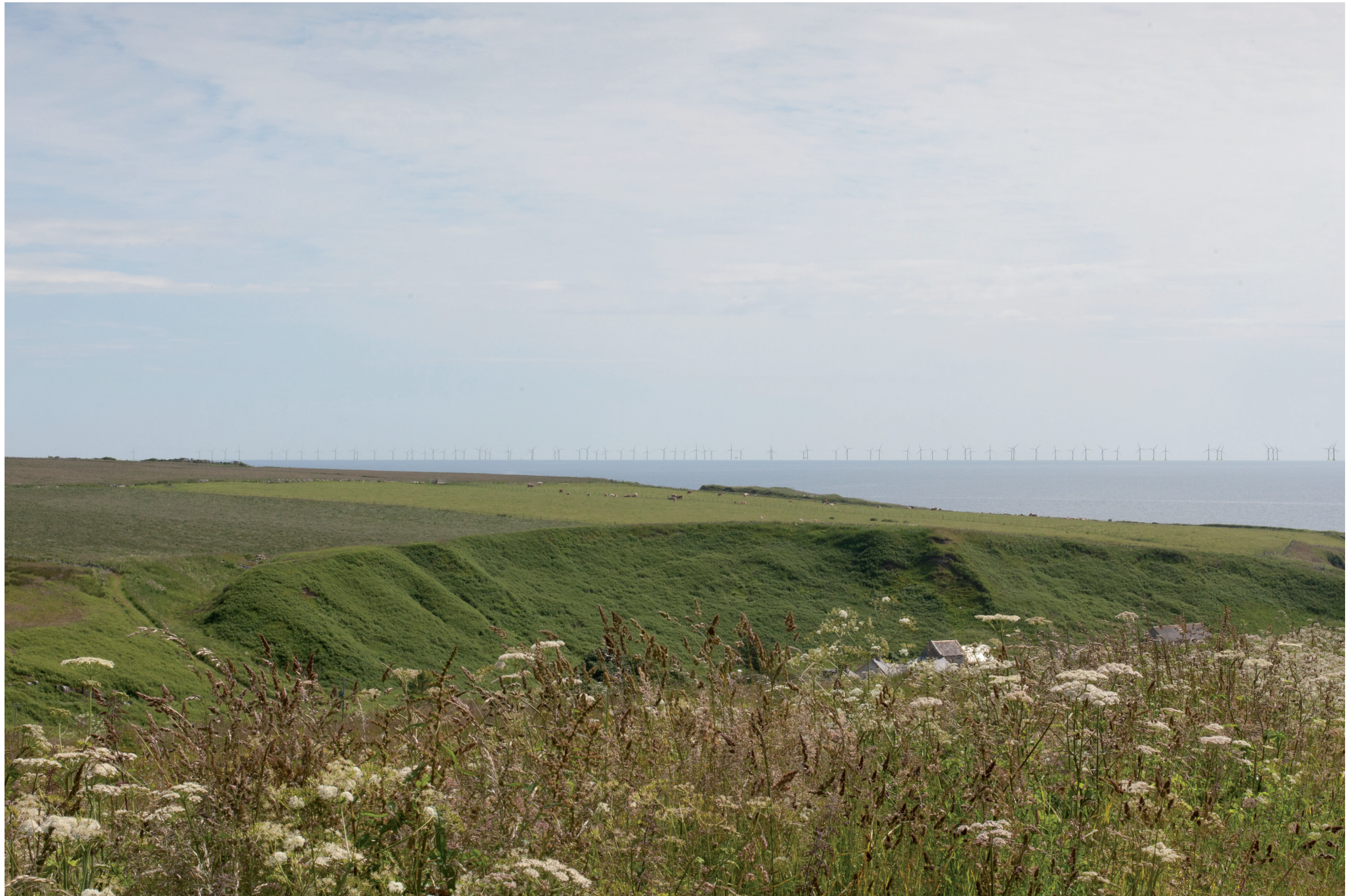
VIEWPOINT 9 - DUNBEATH (NR HERITAGE CENTRE)