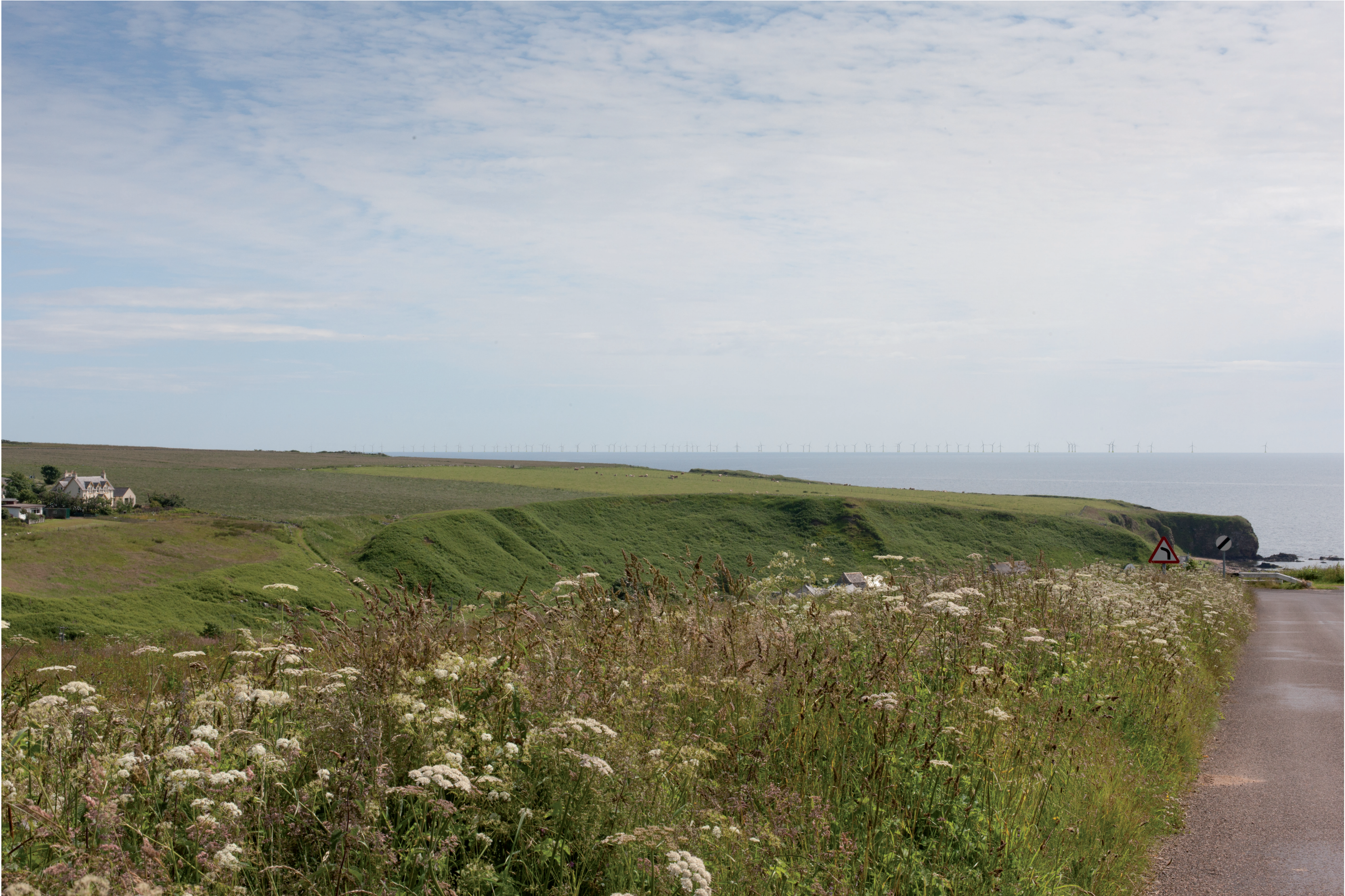
VIEWPOINT 9 - DUNBEATH (NR HERITAGE CENTRE)

Distance to nearest turbine: 25.7km Camera: Canon EOS 5D Mark II Focal length: 50mm Camera height: 1.5m Date: 16/07/2015 Time: 11:41