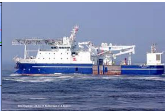
Example of Vessel