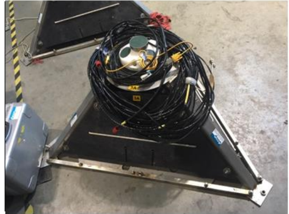
Figure 1 – AWAC wave, current and tidal profiler and typical bottom frame.