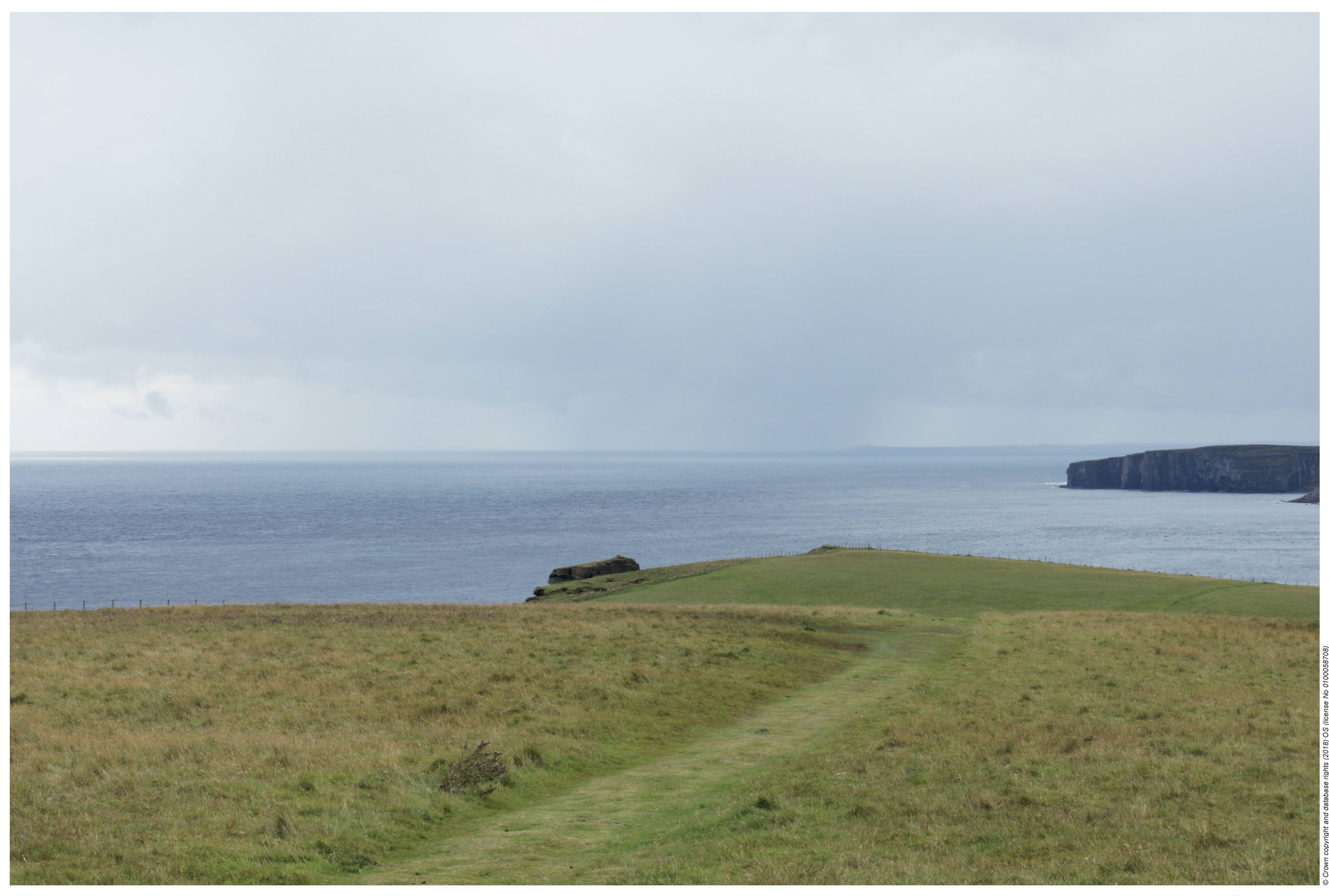
Distance to nearest turbine: 53.35km Camera: Canon EOS 5D Mark II Focal length: 75mm Camera height: 1.5m Date: 02/09/2011 Time: 12:20

Figure 14.7.9e Viewpoint 1 : Duncansby Head 75mm Single Frame Photo