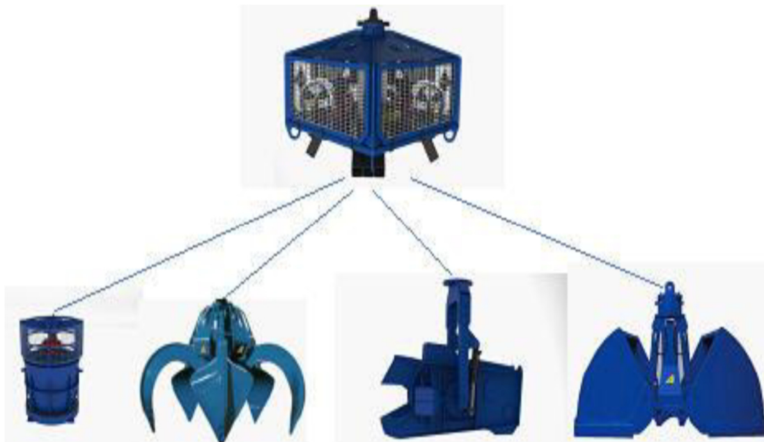
Figure 2-1: Examples of mechanical subsea grabs equipped with (from left to right) small scale jetter cherry picker, grab, cutter or clam grab