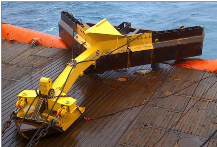
Figure 2-2: Example of a displacement plough