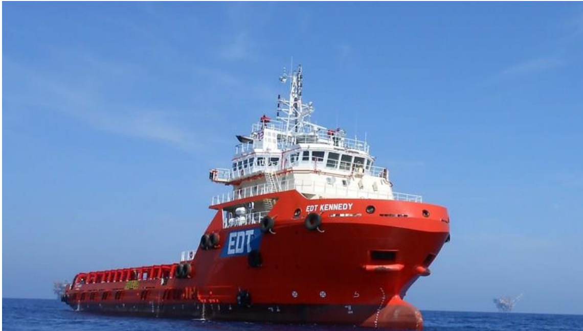
Figure 2-3 Example DP2 vessel