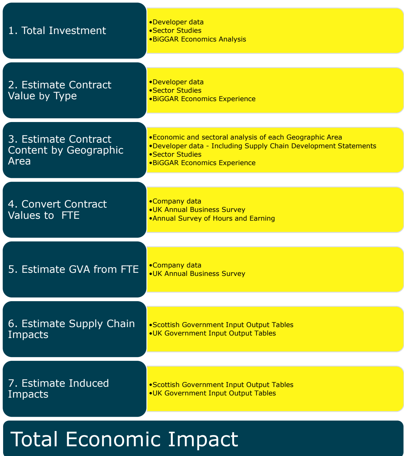
Figure 3-2: Economic Impact Methodology and Data Source.