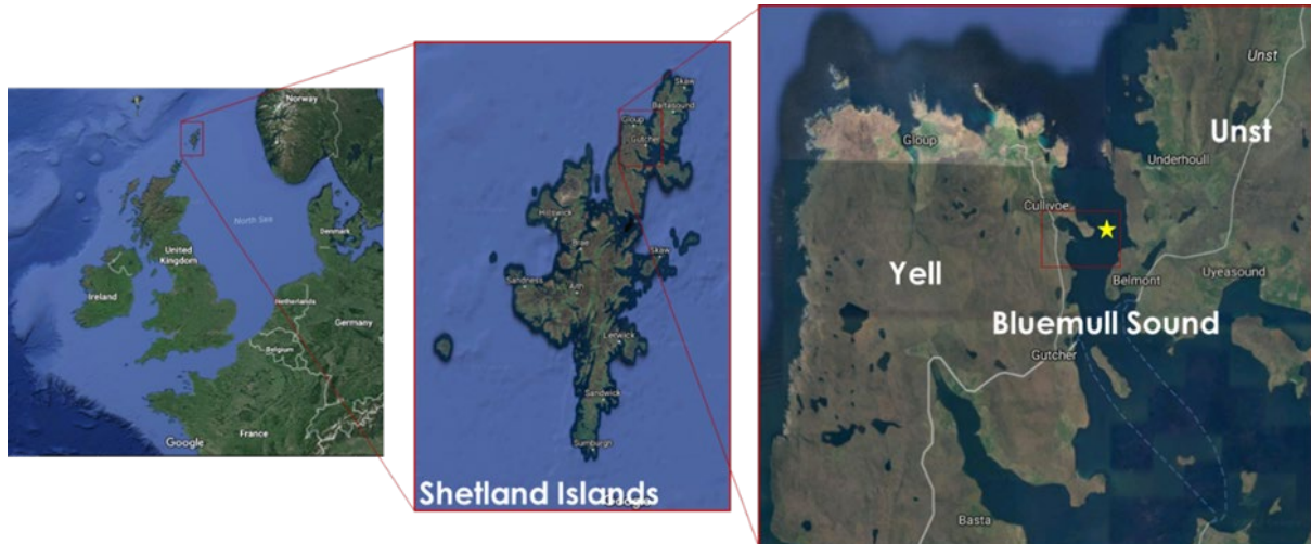
Figure A1 Location of the Shetland Tidal Array (indicated by yellow star).

Bluemull Sound is an active channel for shipping and the Shetland Tidal Array site is located less than 1km from a busy, multiuse harbour at Cullivoe, comprising a pier and small boat marina. In 2017, Cullivoe was the 12 th largest whitefish landing port in the UK 20 . It is also used as a base by a number of aquaculture operators (mussels and salmon). The small marina currently provides berthing facilities for 14 boats, with plans to expand these facilities along with those at Cullivoe Pier.