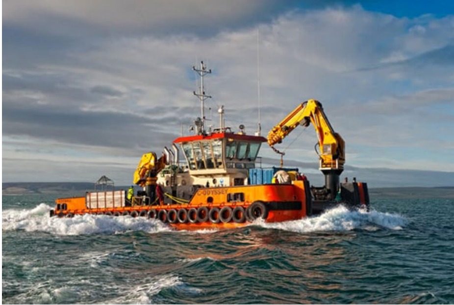
Figure A2 Representative vessel utilised for Shetland Tidal Array operations.