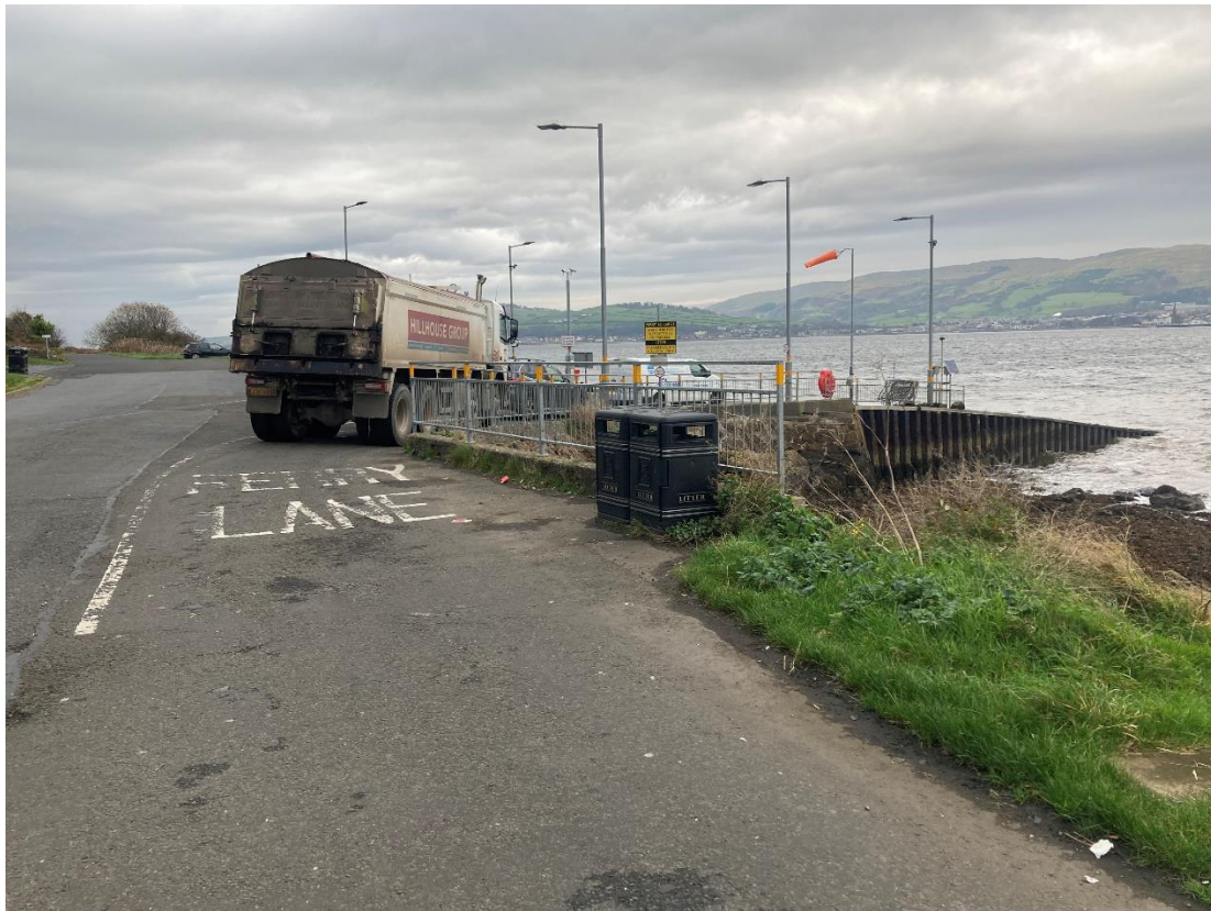
Photo 7 -View from road looking north towards existing slipway