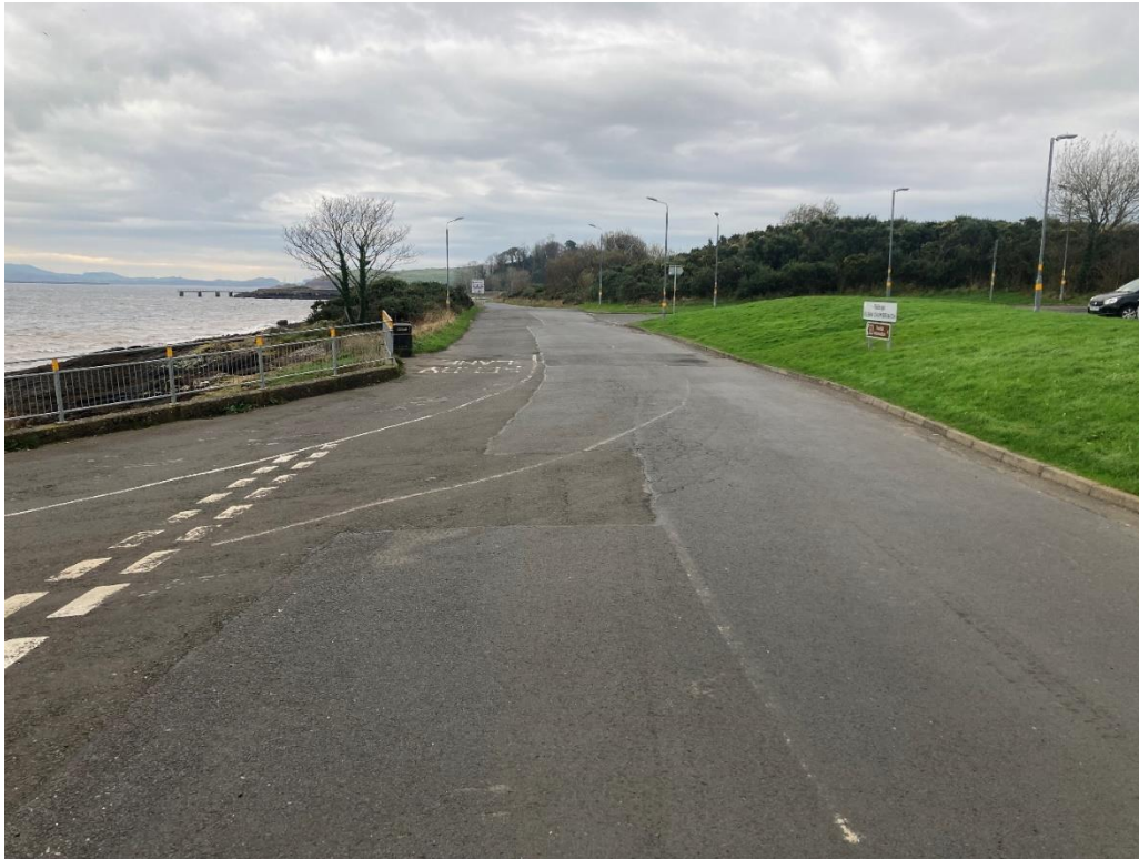
Photo 1 – View from top of existing slipway looking south along road