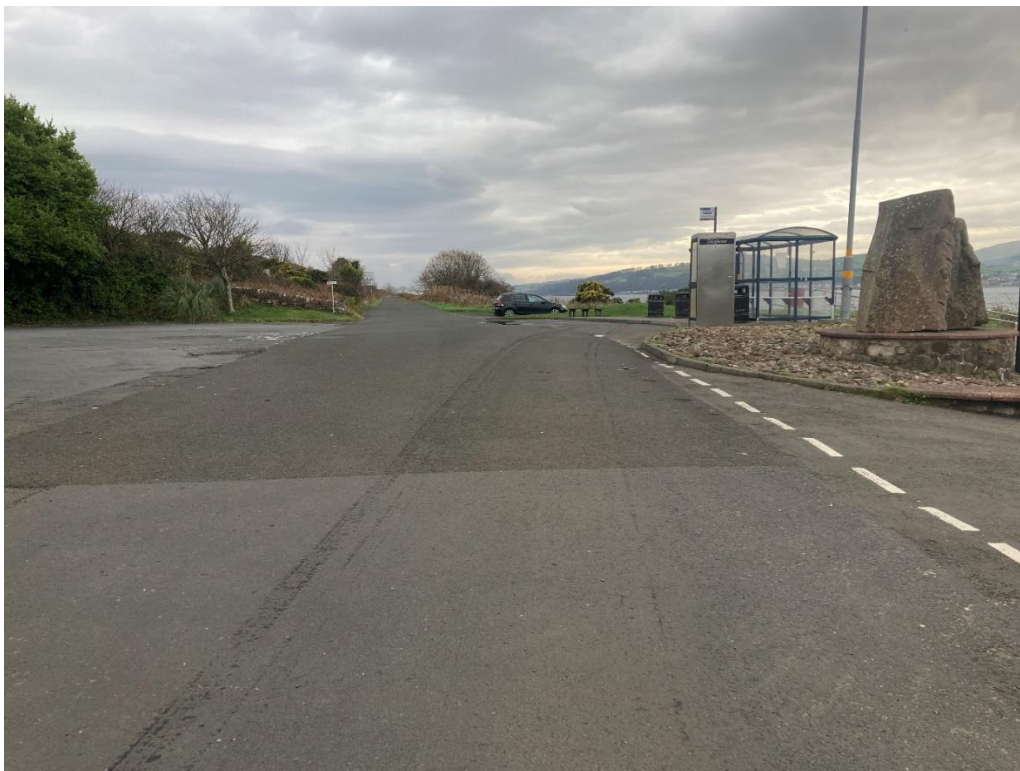
Photo 2 – View from top of existing slipway looking north along road