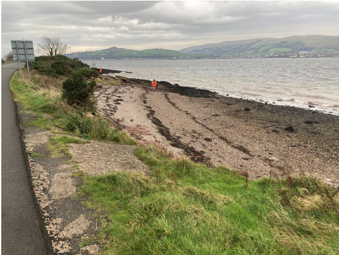
Photo 5 -View from road looking north towards existing slipway