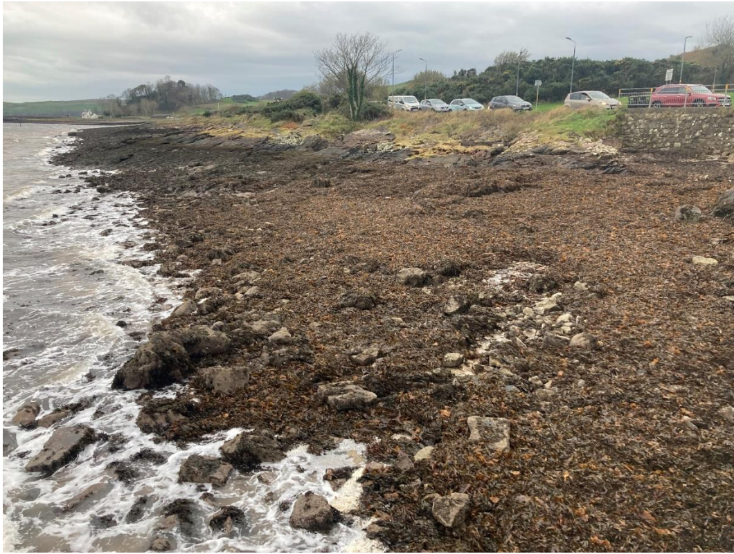
Photo 3 – View from foreshore close to existing slipway looking south