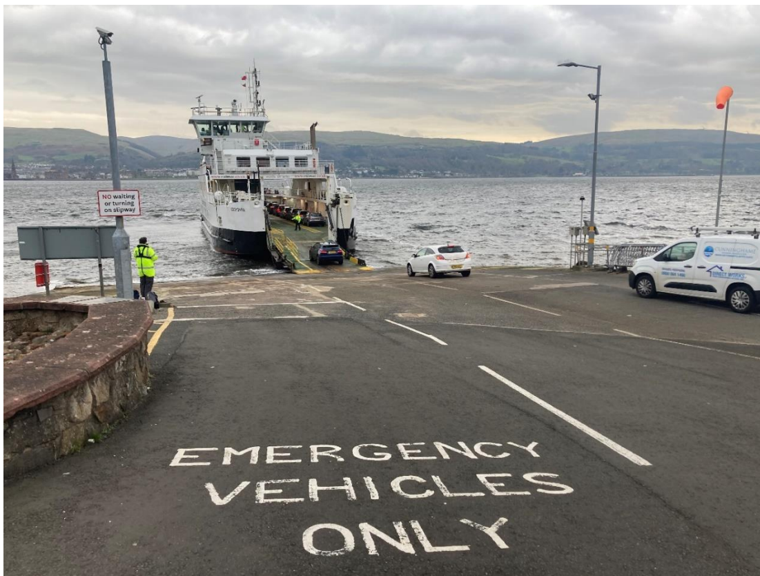
Photo 8 -View of existing slipway in operation