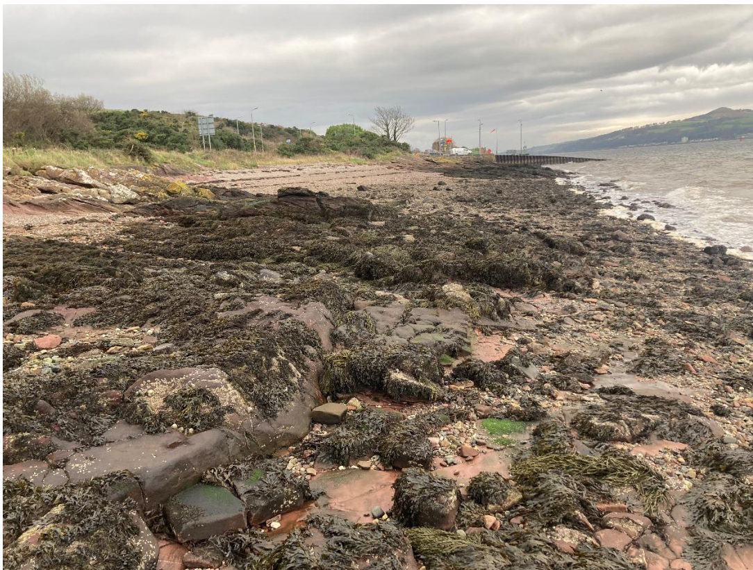
Photo 6 -View from foreshore looking north towards existing slipway