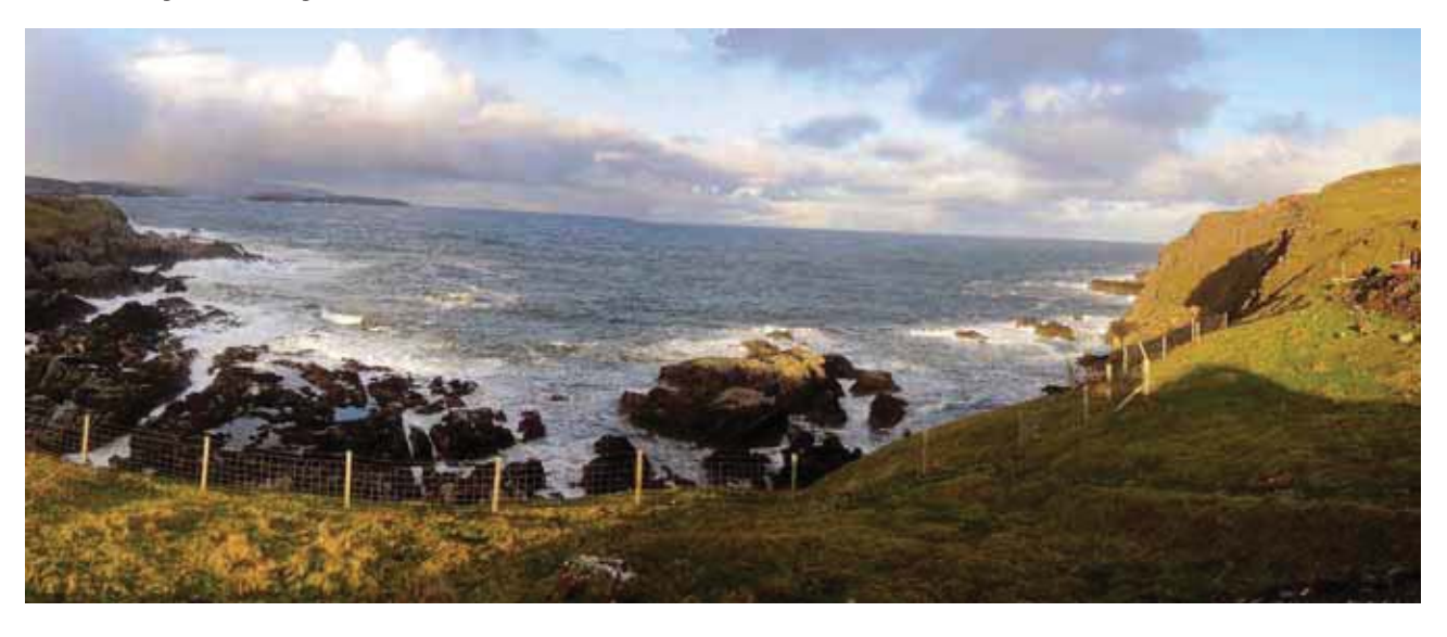
Farr Bay, Strathy and Portskerra