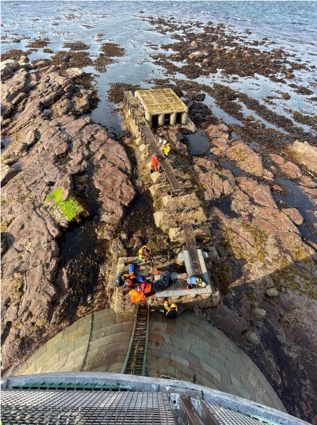
Missing Walkway Gratings