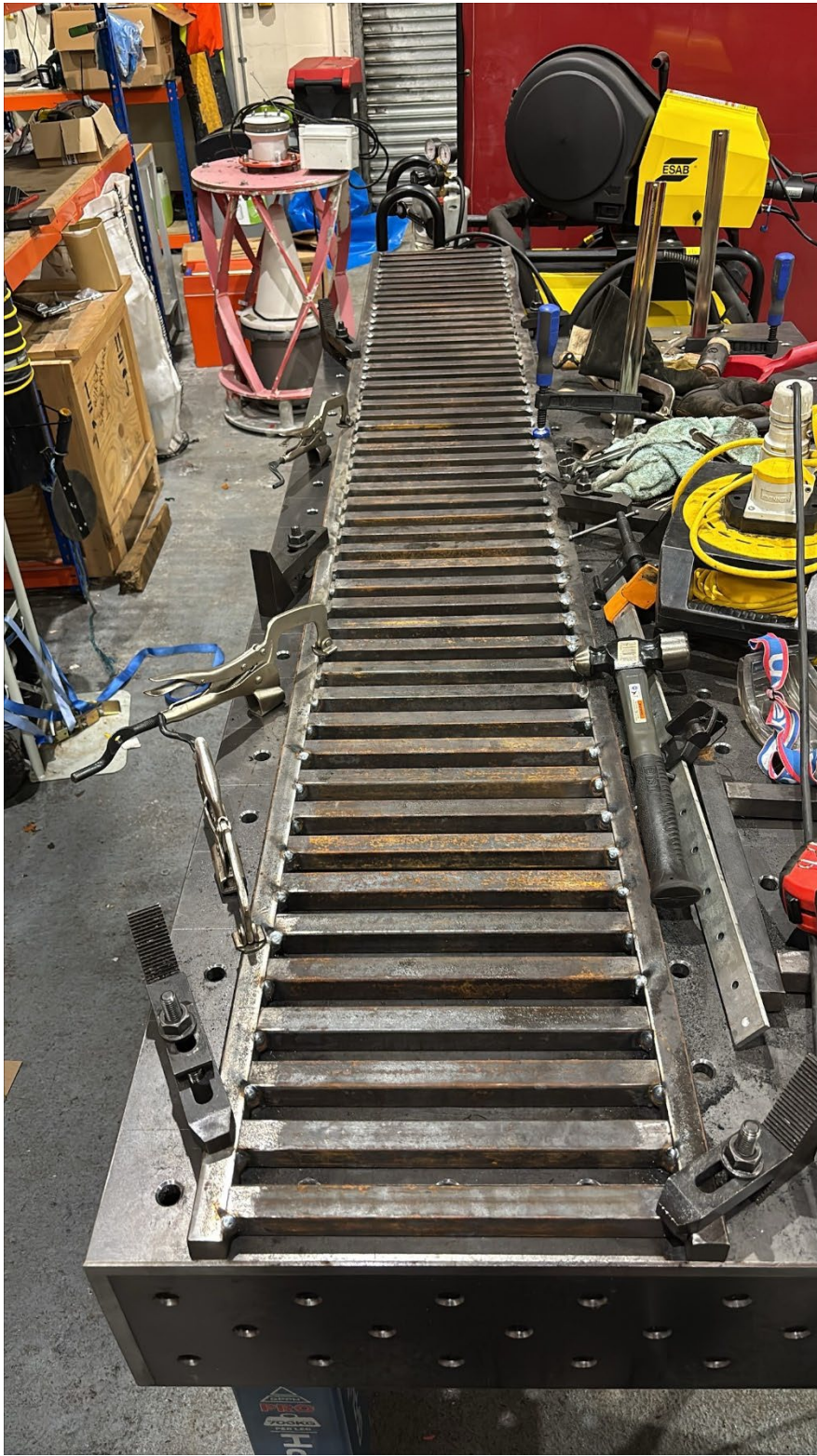
New Walkway sections fabricated from Mild Steel at NLB Oban Depot