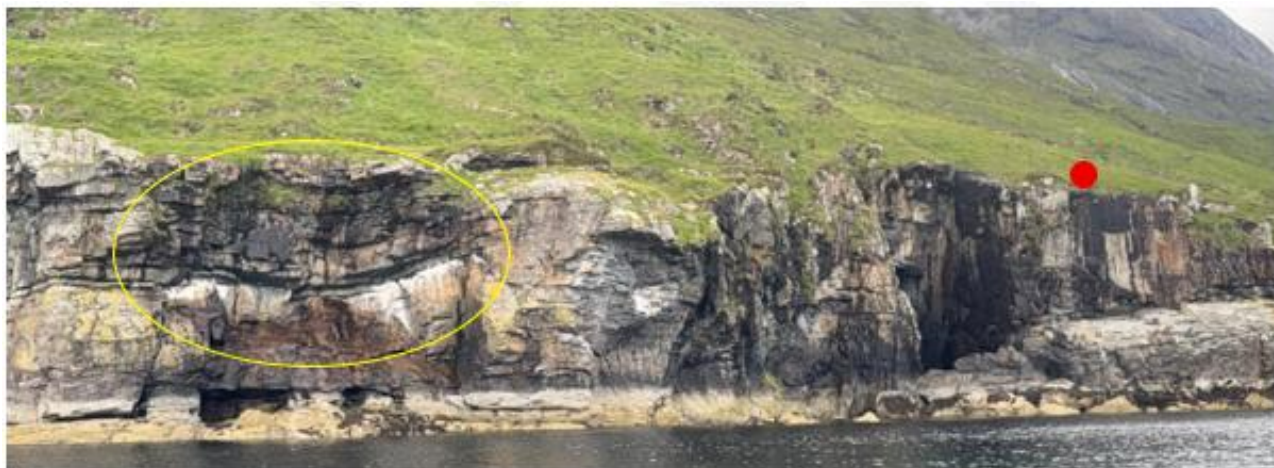
Figure 4.3. The location of a rat trapped in south-east Rum (red dot) which had guillemot DNA in its stomach sample. Ledges occupied by guillemot, approximately 100m from the trap site are indicted (yellow circle).

4.5.1.14 This is very strong evidence that brown rats are able to access seabird breeding areas and feed on seabirds, although it must be acknowledged that this may have been a scavenging event (albeit on remains within a breeding colony) rather than predation. Nonetheless, there does seem to be a clear indication that rats have the ability to eat eggs and young chicks and thereby suppress seabird populations.