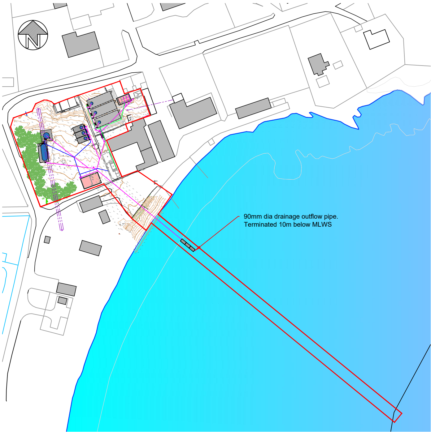
Location Plan Showing Extent of Sea Outfall Pipe