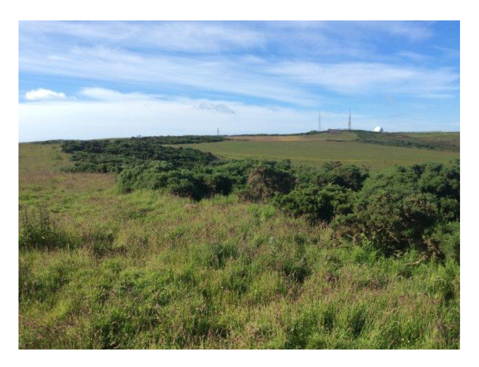
Plate 7: View of scrub colonised ditch in south of site (Watercourse G).