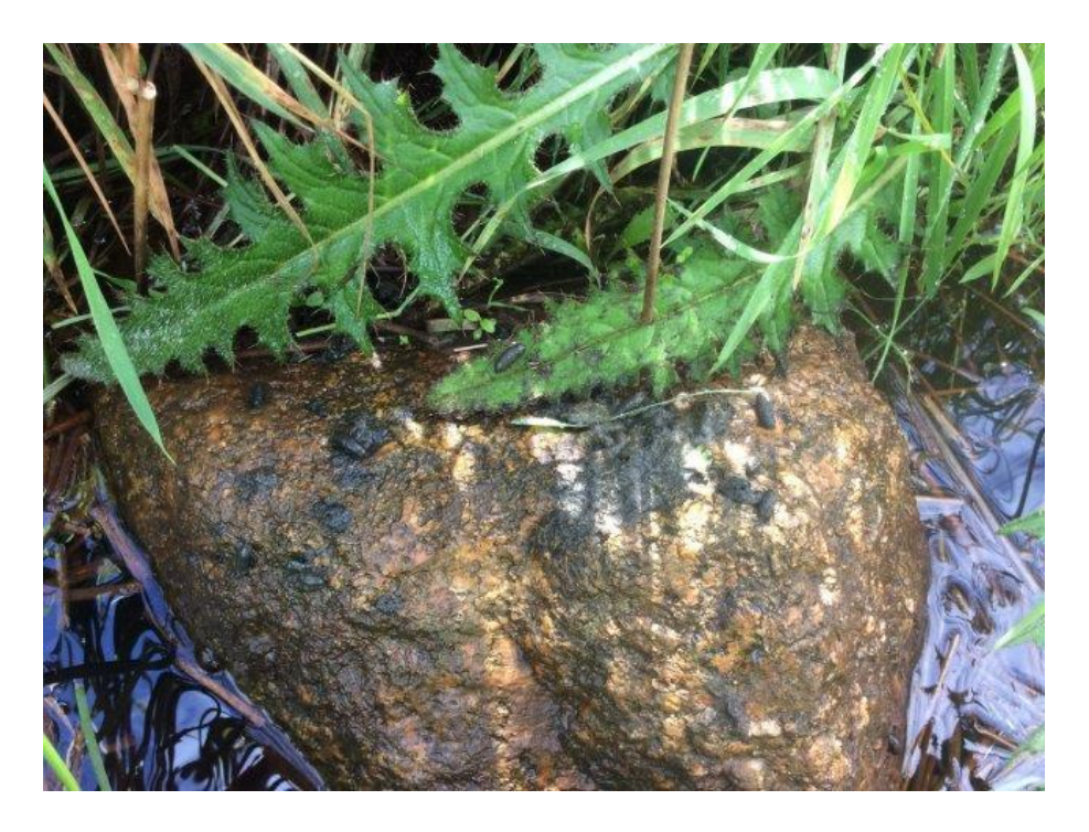
Plate 9: Watervole latrine on Watercourse C.