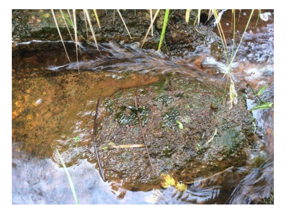
Plate 8: Watervole latrine on Watercourse G.