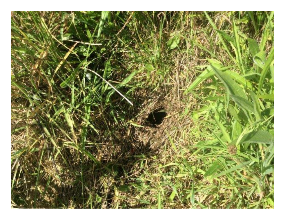
Plate 10: Watervole burrow on Watercourse C.