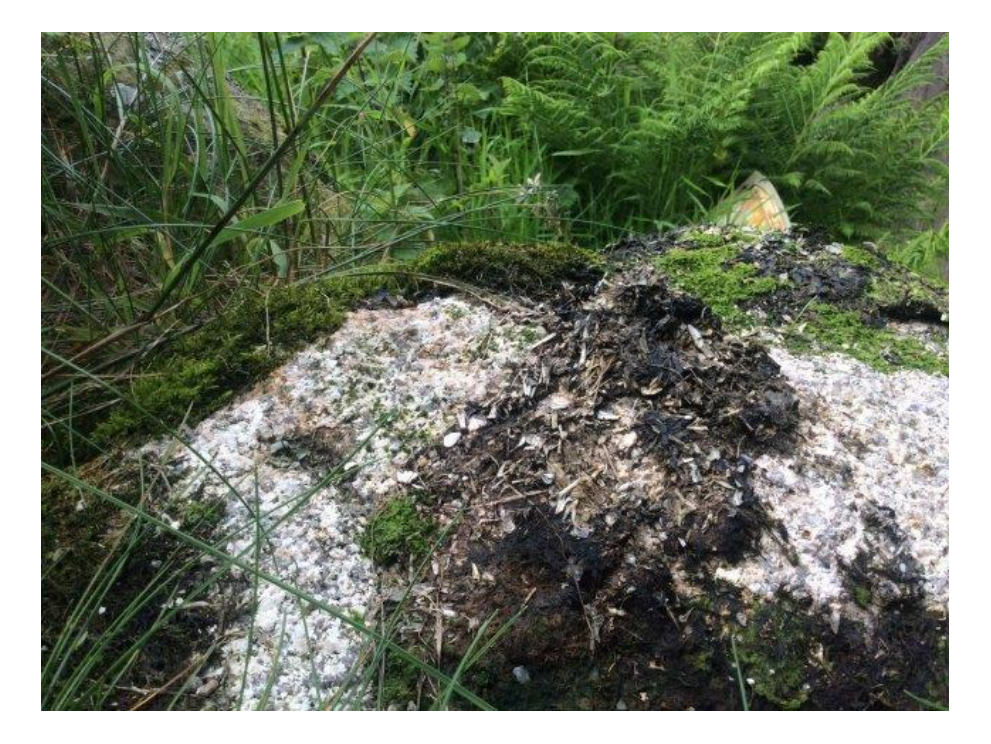
Plate 4: Further significant sprainting in close proximity to open areas beneath boulders (holt).