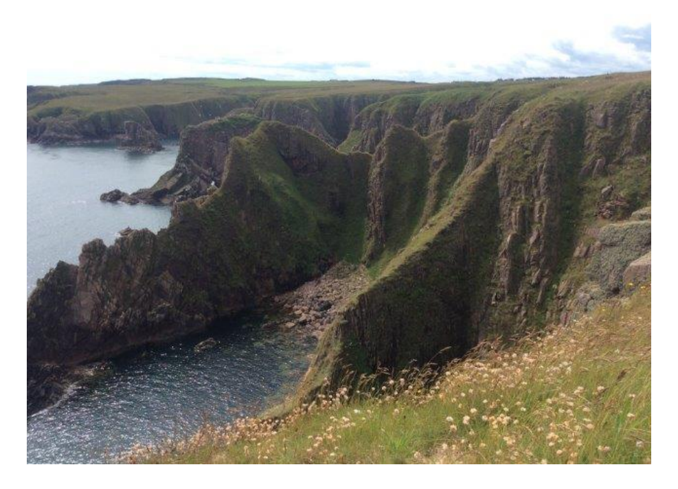
Plate 1: View south along coastline which forms southern boundary of Survey Area.