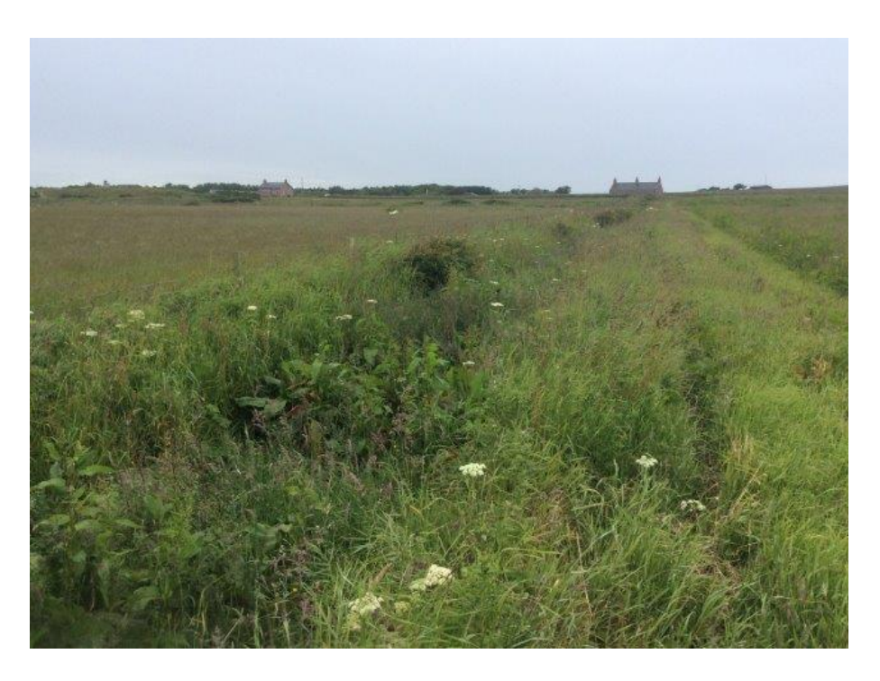
Plate 5: Typical overgrown agricultural drain offering good water vole habitat (Watercourse E).