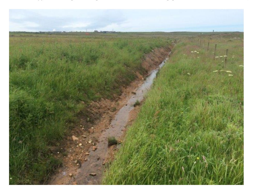
Plate 6: Section of recently cleared agricultural ditch (Watercourse H)