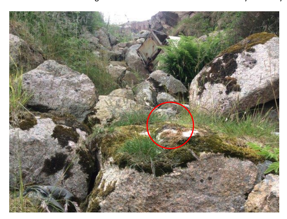
Plate 2: Boulders leading to otter holt location. Extensive sprainting identified (open circle).