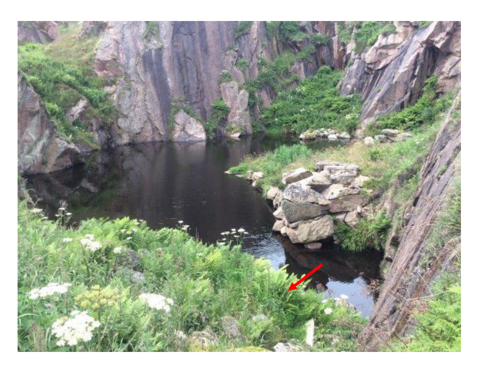
Plate 3: Waterbody 4 with approximate location of holt marked.