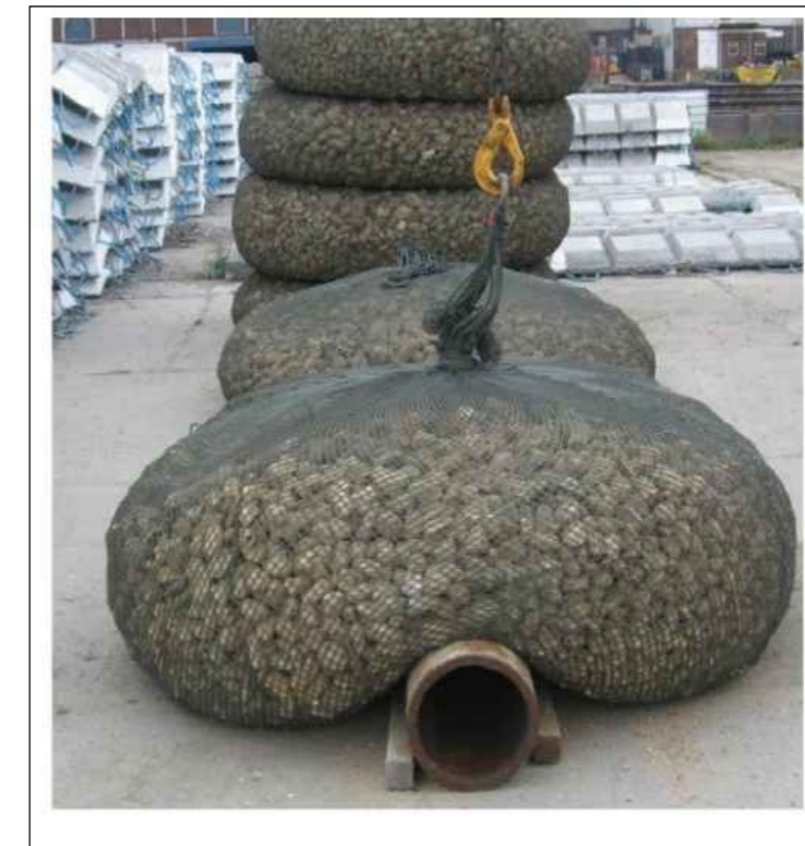
Photo example - bag over pipe