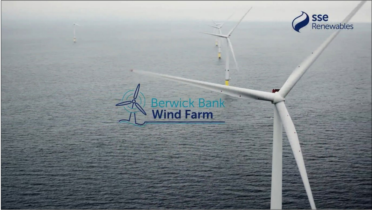
A project video