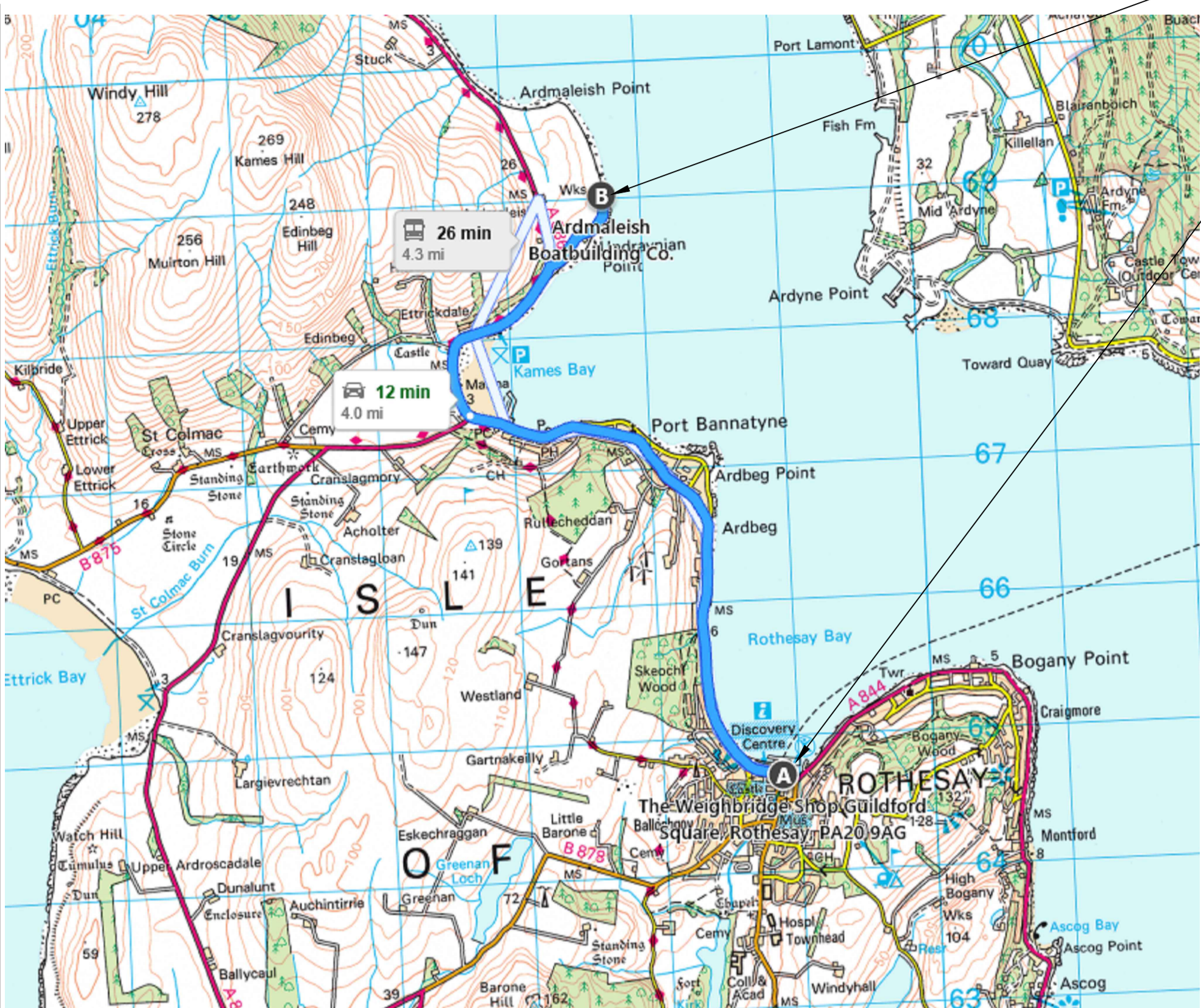
Route from Rothesay Harbour to disposal site Not to Scale

Location of disposal site for existing pontoons. This site is approximately 4 miles from Rothesay Harbour via road. Address: Ardmaleish Boatbuilding Co. Isle of Bute PA20 0QY Location of existing pontoons, at Rothesay Outer Harbour.