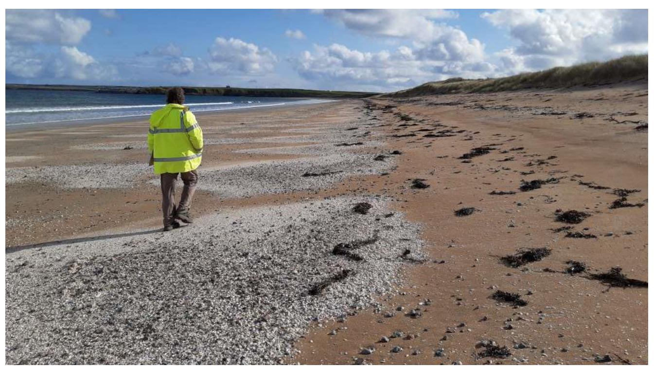
Existing Beach Looking south-east

To indicate how the existing Beach and Headland currently look