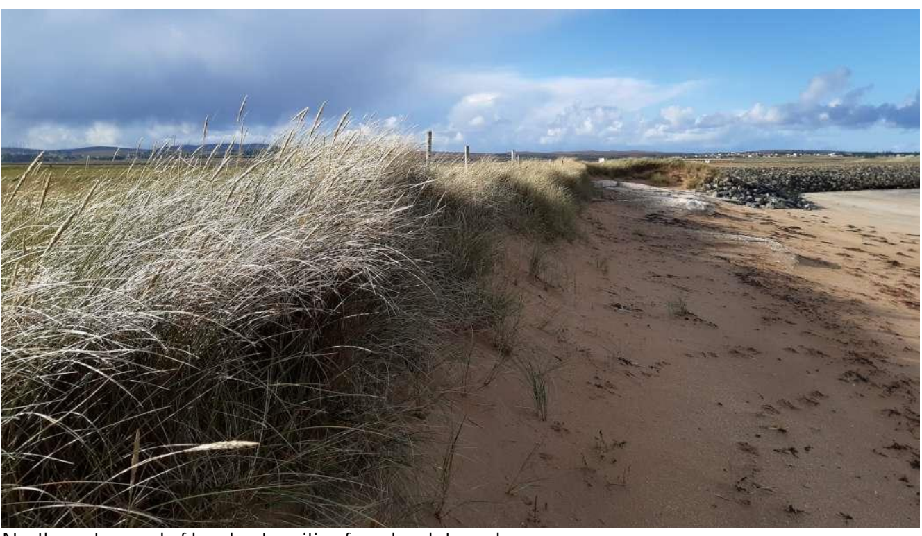
North-western end of beach – transition from beach to rock armour