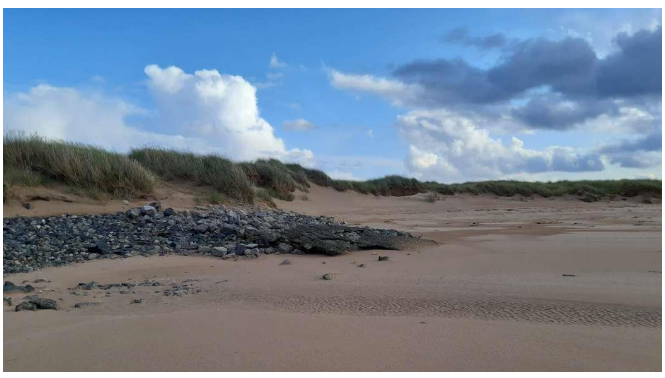
Beach on estuary/salt marsh side, at Headland