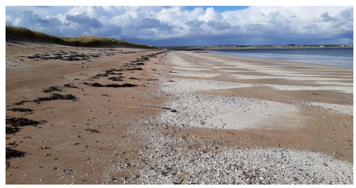
Existing Beach looking north-west