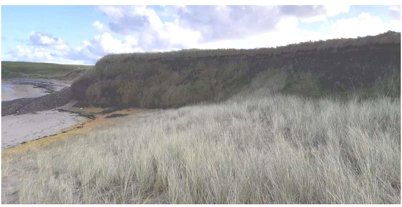
South-eastern end of beach (where protection will end) looking at rock outcrop