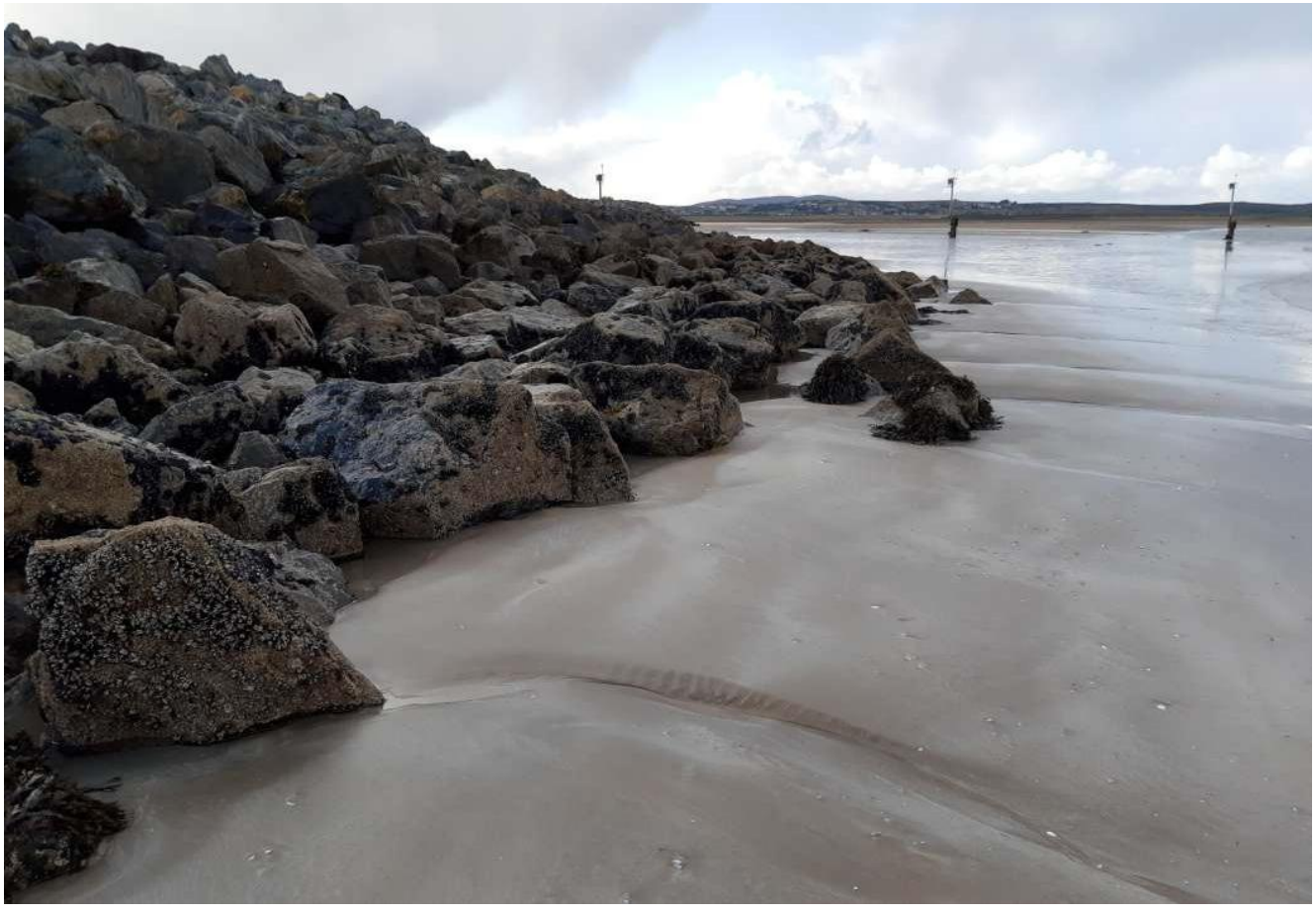
Northern end of rock armour headland