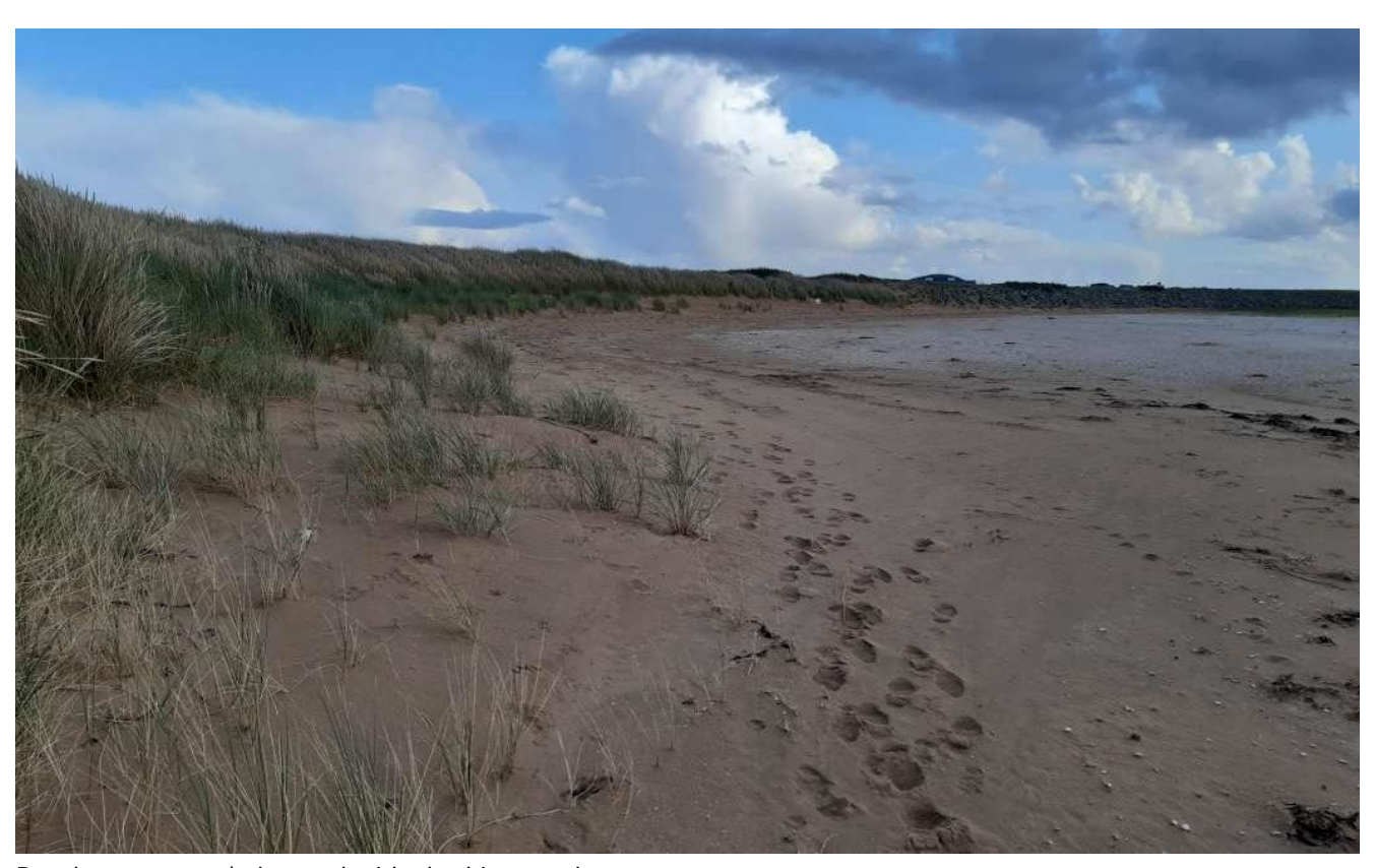
Beach on estuary/salt marsh side, looking south-west