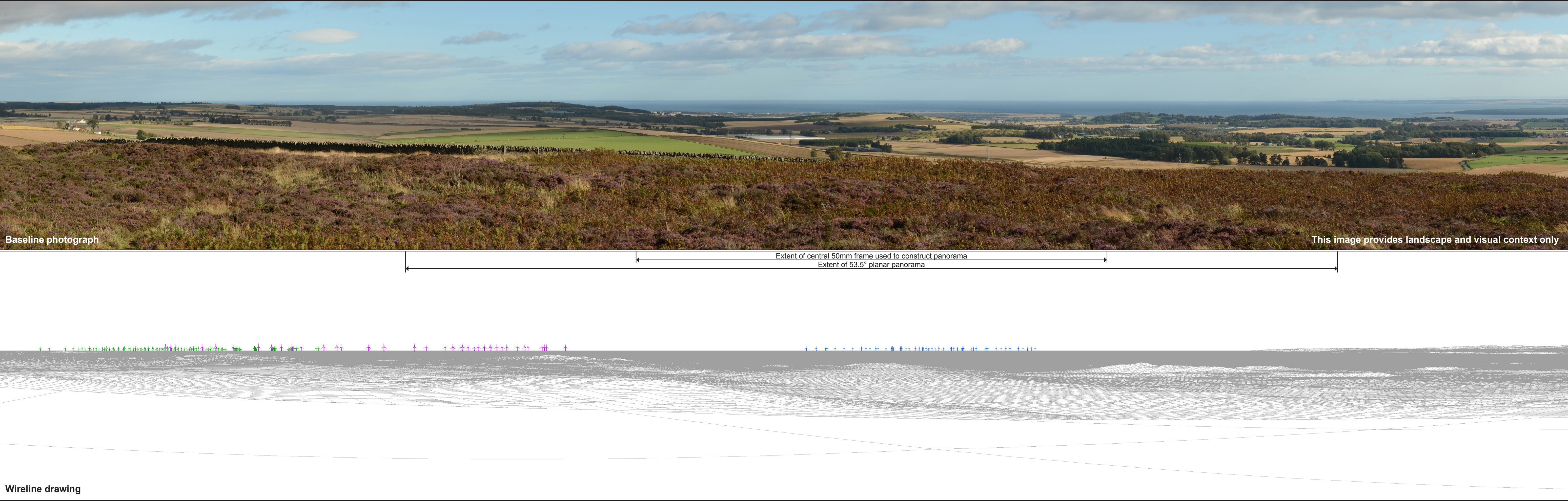
Figure: 14.19.2 Viewpoint 5: Dodd Hill