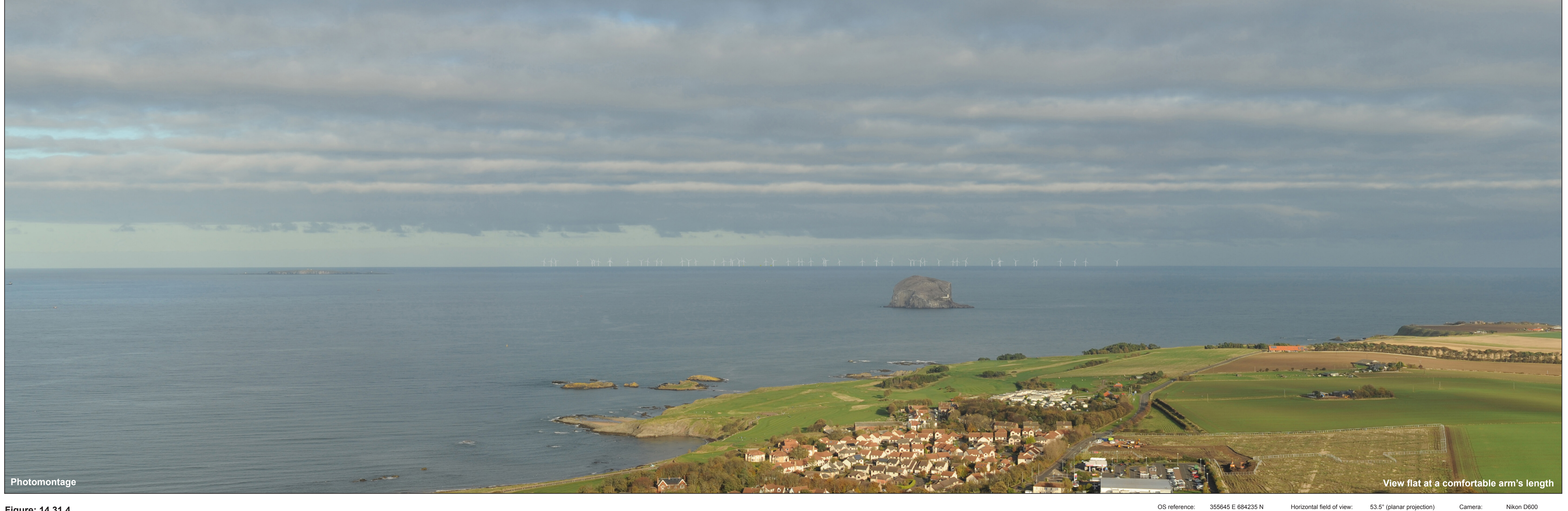
Figure: 14.31.4 Viewpoint 17: North Berwick Law

OS reference: 355645 E 684235 N AOD: 185 m Direction of view: 50° Nearest turbine: 33.1 km