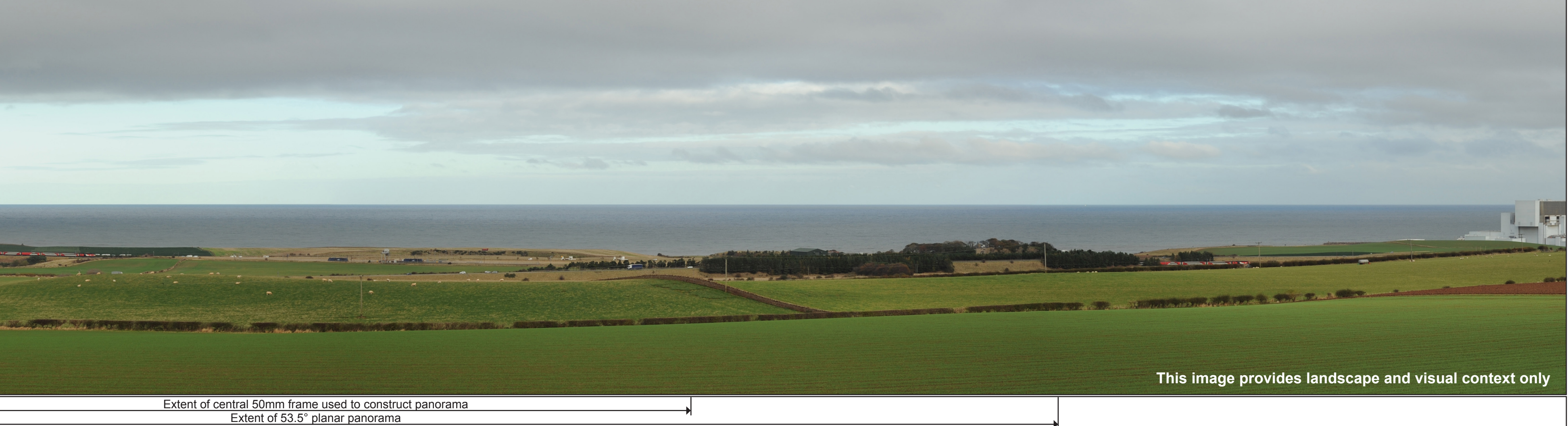
Figure: 14.33.2 Viewpoint 19: Innerwick

Cumulative Wind Farm Neart na Gaoithe key (by status): Inch Cape Seagreen