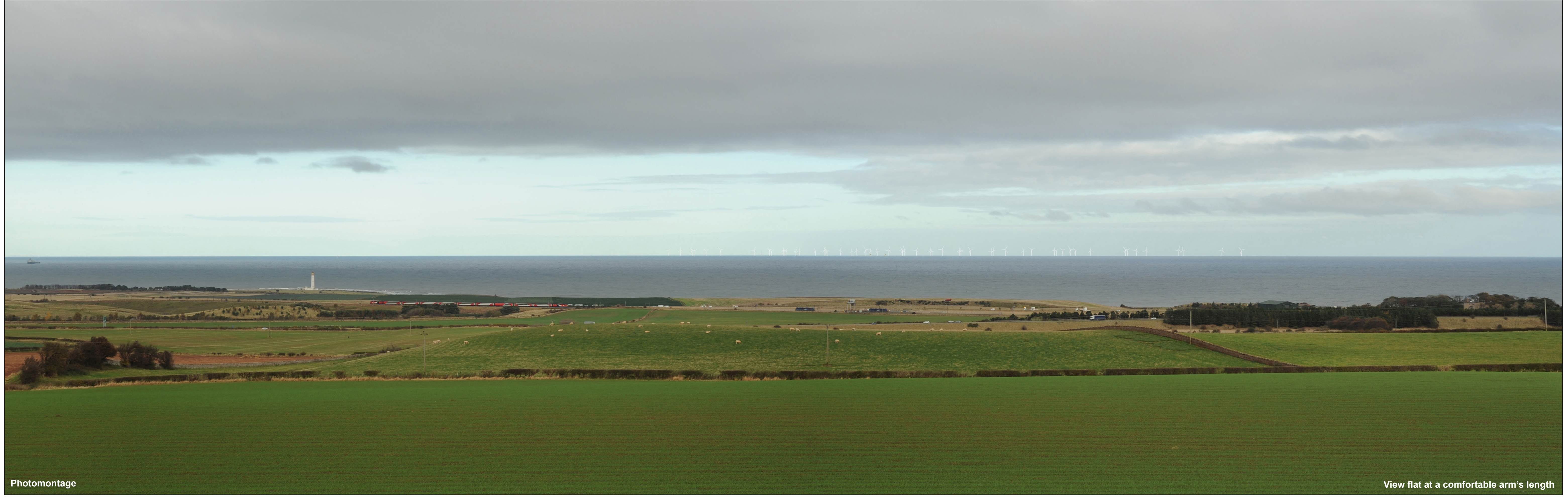
Figure: 14.33.4 Viewpoint 19: Innerwick

OS reference:372437 E 673859 NAOD:92 mDirection of view:15°Nearest turbine:30.5 km