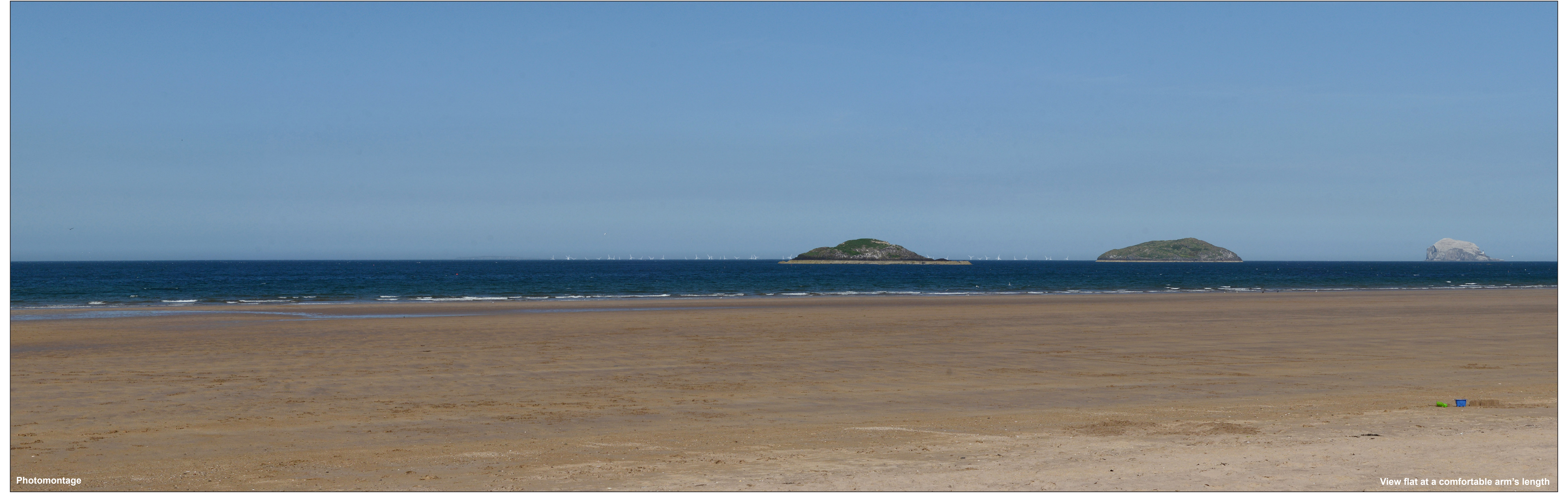
Figure: 14.40.4 Viewpoint 26: Broad Sands, North Berwick

OS reference: 352222 E 685811 N AOD: 0 m Direction of view: 55° Nearest turbine: 35.0 km