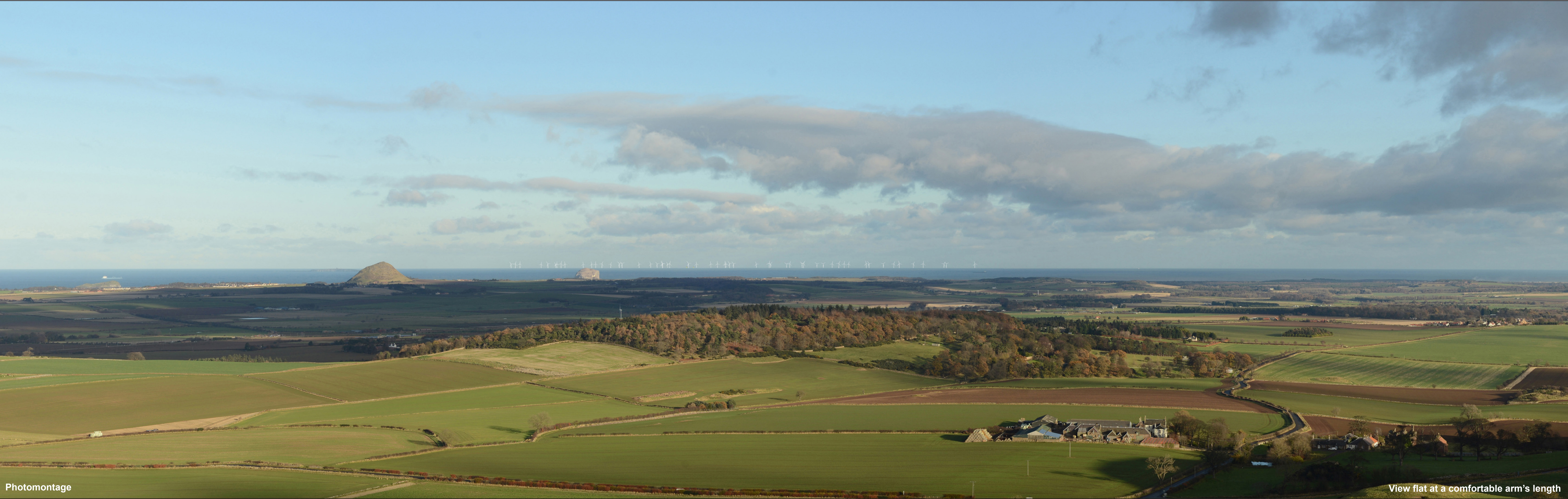
Figure: 14.43.4 Viewpoint 29: Hoptoun Monument