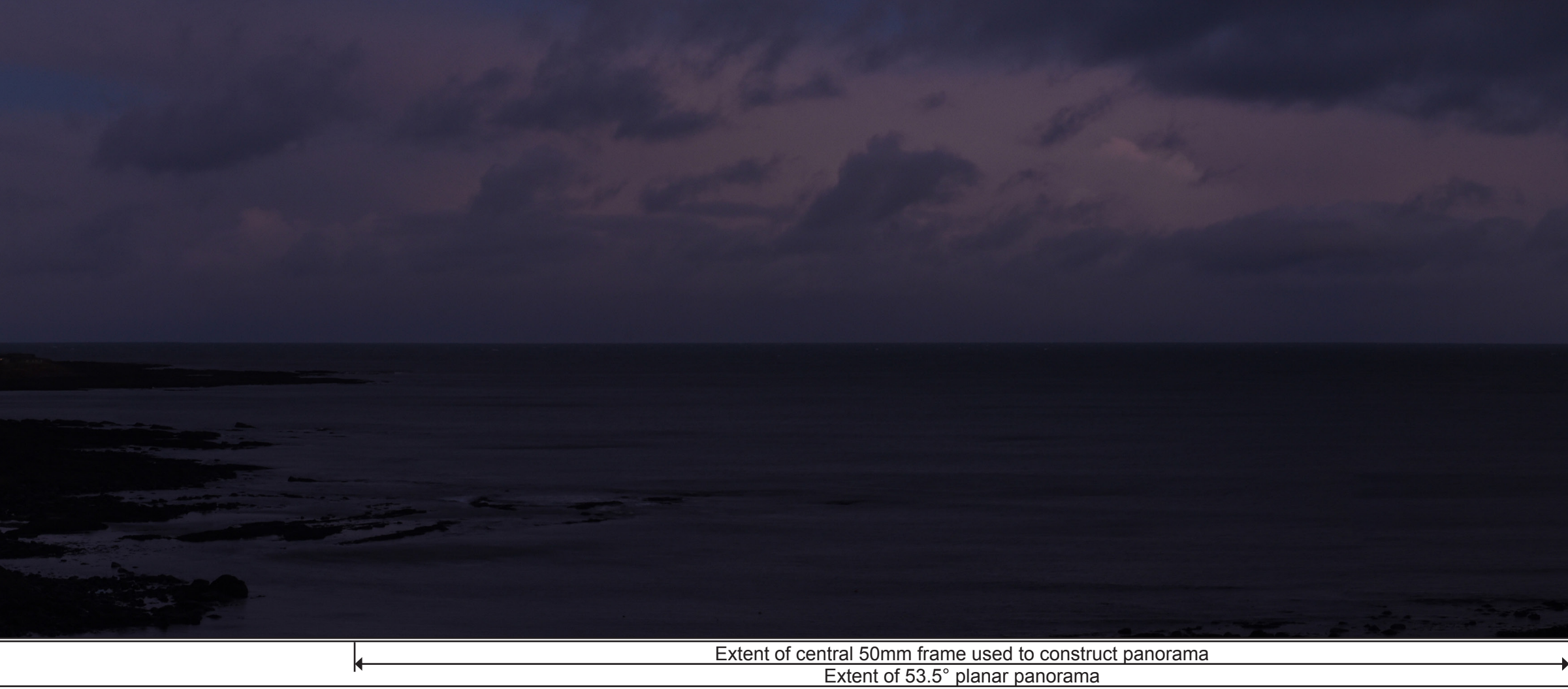
Figure: 14.48.2 Viewpoint N5: Crail