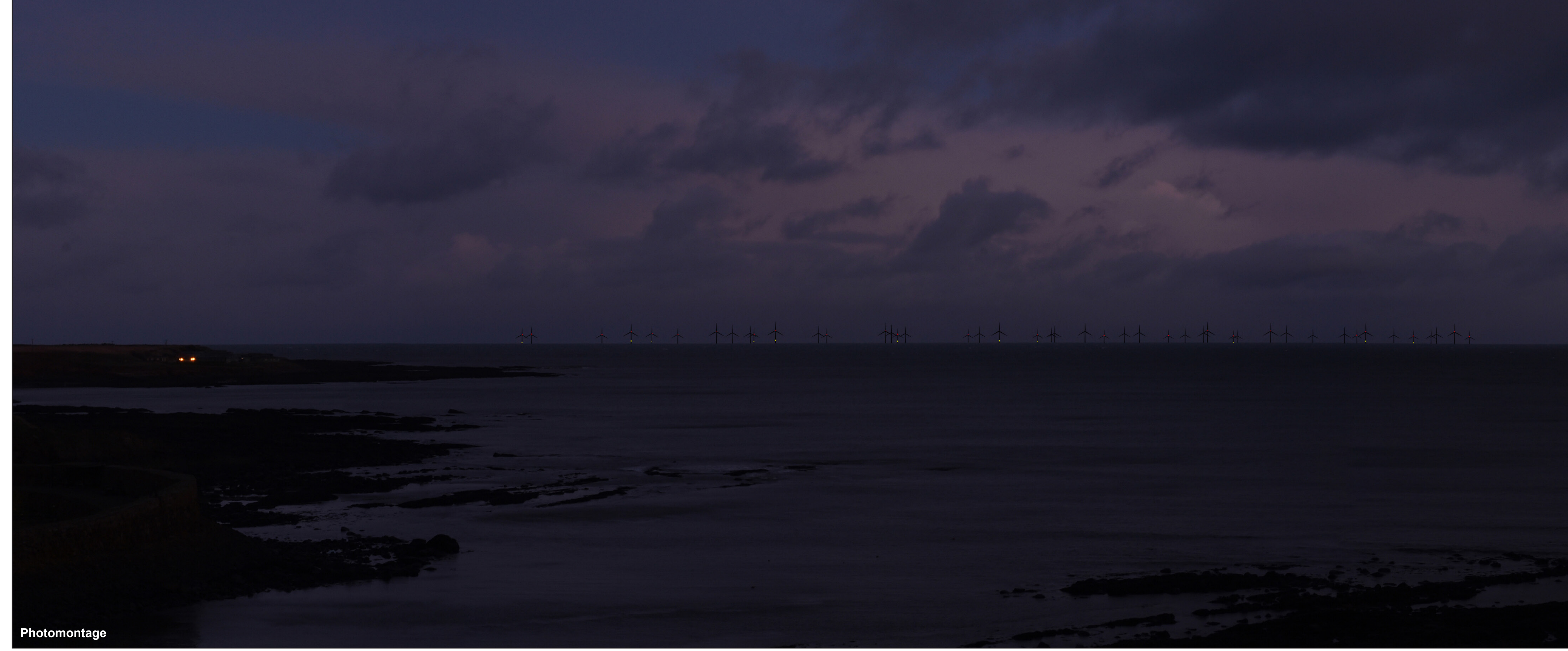
Figure: 14.48.4 Viewpoint N5: Crail