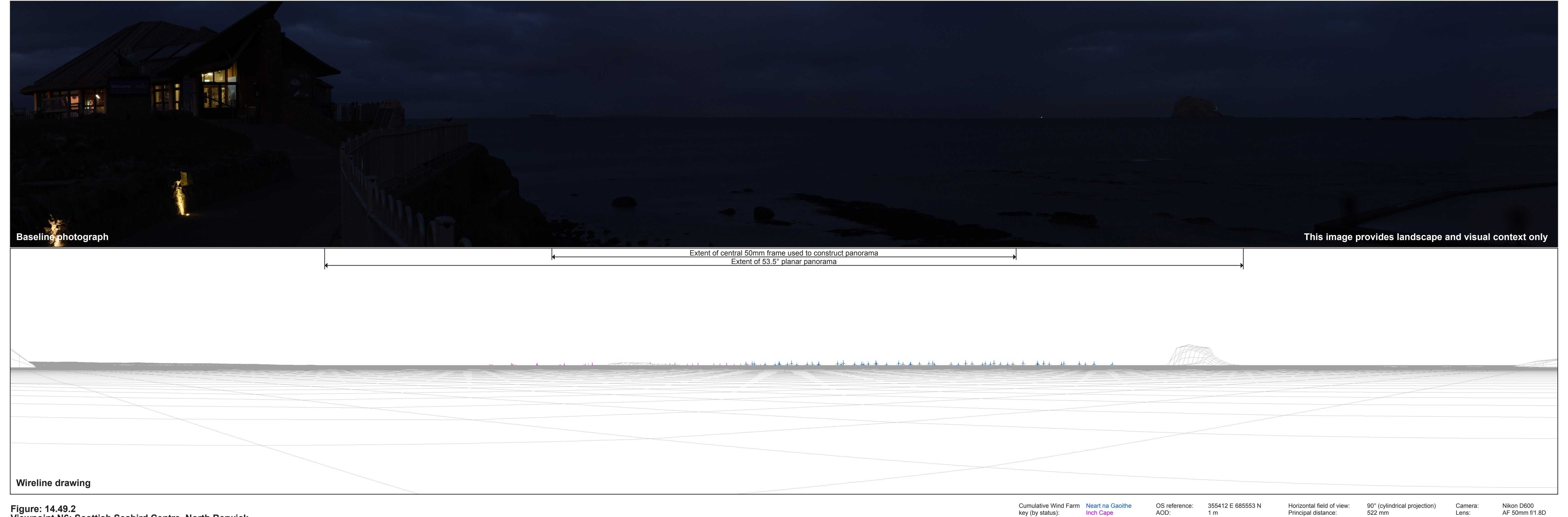
Figure: 14.49.2 Viewpoint N6: Scottish Seabird Centre, North Berwick

OS reference: 355412 E 685553 N AOD: 1 m Direction of view: 45°