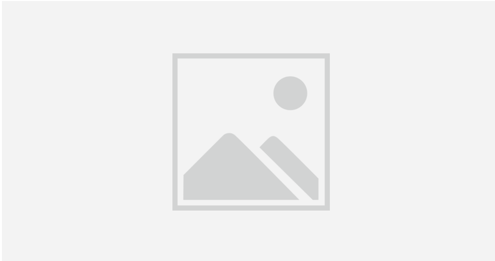
Figure 1: Cable bundle cross-section

The proposal is to install a HVDC electricity transmission cable circuit across the Moray Firth between Noss Head near Wick in Caithness and Portgordon in Moray. The installed circuit comprises two HVDC cables and a single fibre optic cable. A cross section of the cable configuration is presented in Figure 1 below: