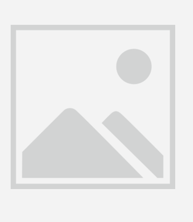
Figure 1: Cable bundle cross-section

The proposal is to install a HVDC electricity transmission cable circuit across the Moray Firth between Noss Head near Wick in Caithness and Portgordon in Moray. The installed circuit comprises two HVDC cables and a single fibre optic cable. A cross section of the cable configuration is presented in Figure 1 below: