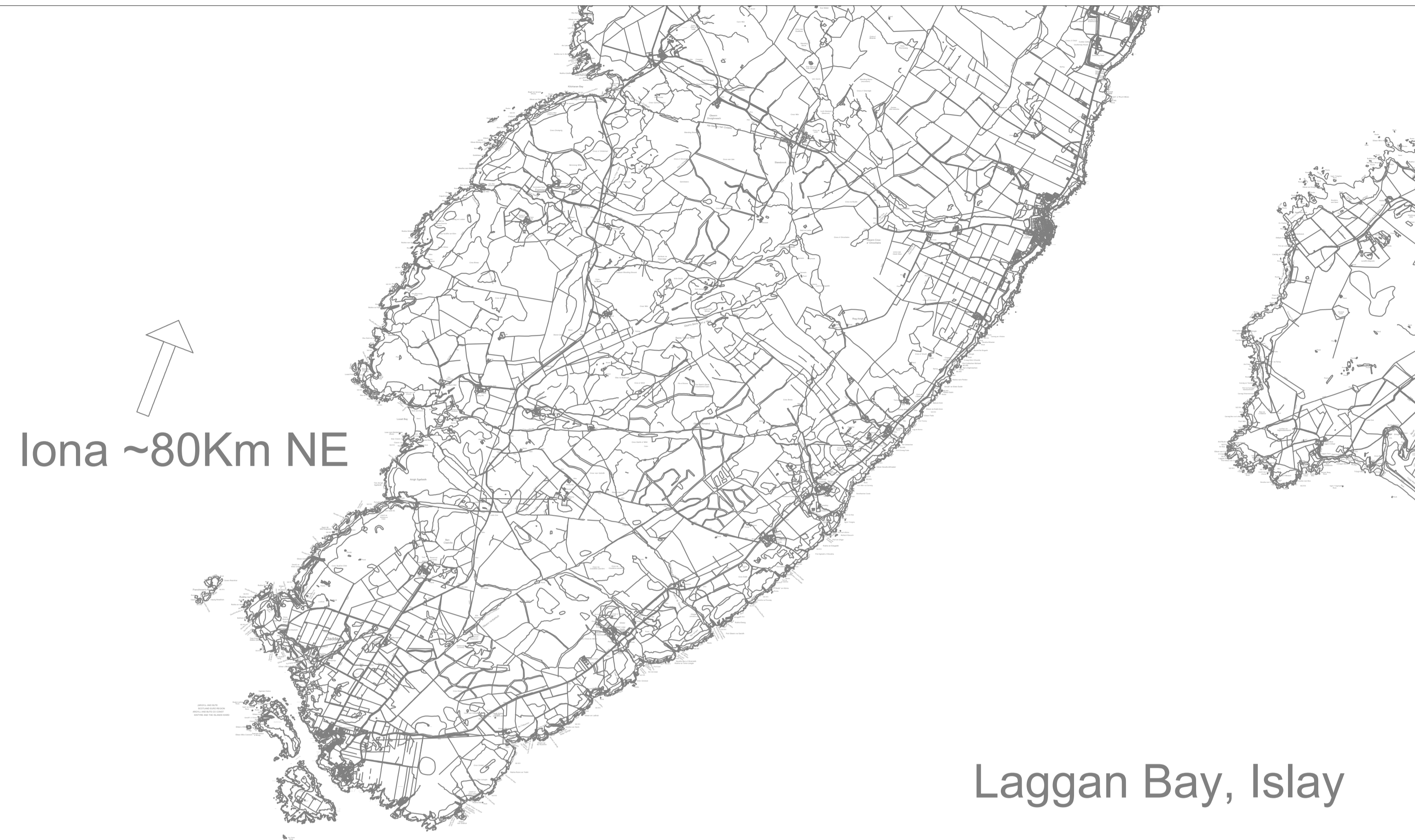
Laggan Bay, Islay