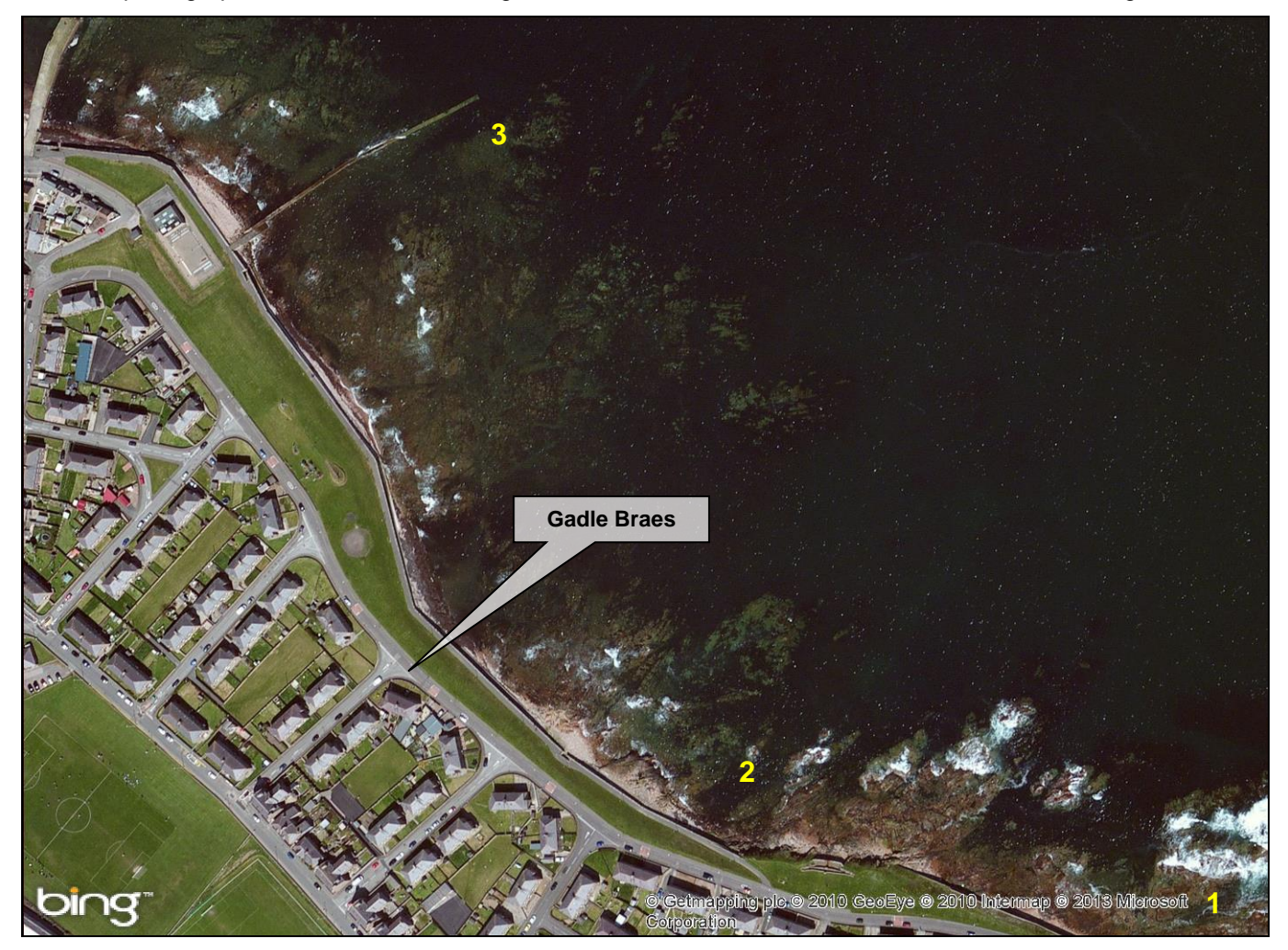
Figure 6: Landfall Site 2 - numbers refer to photos

An aerial photograph of Site 2 is shown in Figure 6 below. Note this site is the base case cable landing location.