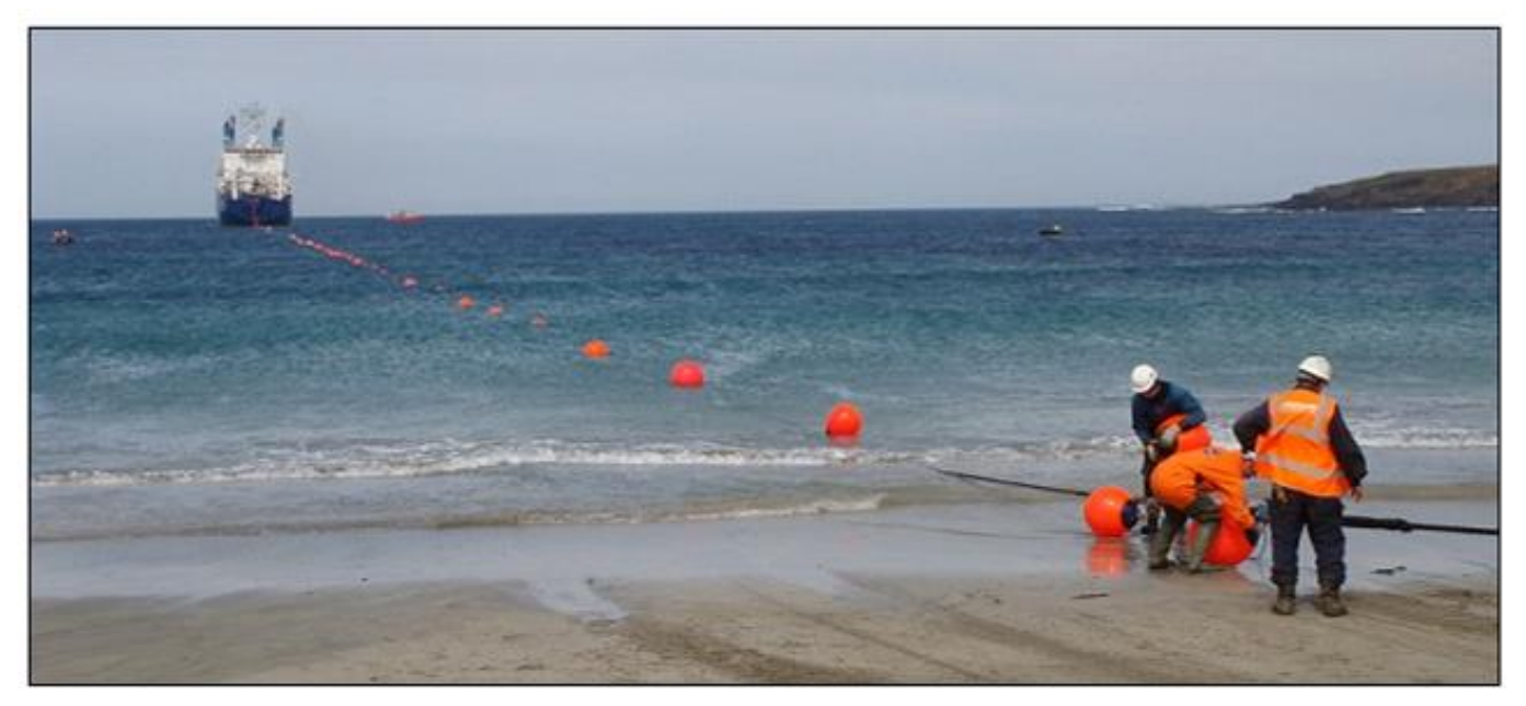
Figure 4: Example of a cable lay vessel linked to a shore approach at a beach landfall

Once a trench has been formed, the offshore cable can be installed from the cable lay vessel by a combination of floating and pulling the cable ashore using a pulling head from a land-based winch (see Figure 4). Therefore, additional consideration to the approach from offshore also needs to be looked at for landfall site suitability.