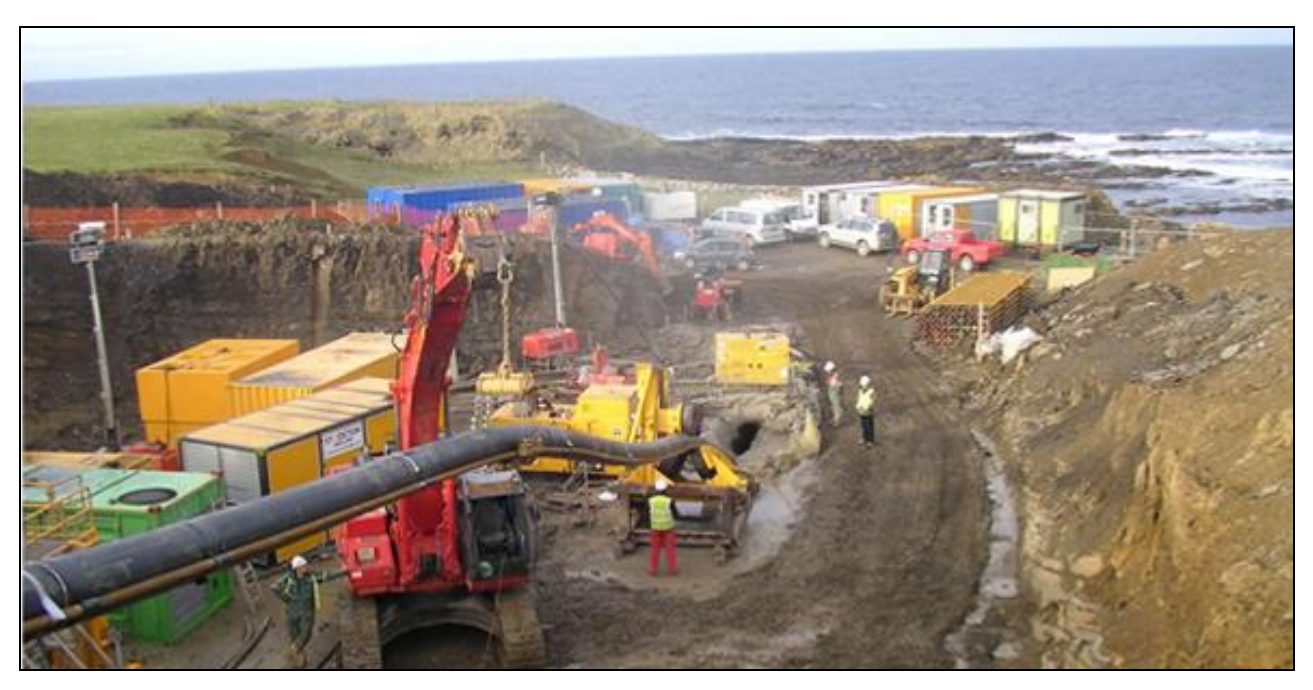
Figure 9: Long HDD drilling for a landfall.

As with all methods of land construction and excavation (e.g. building access roads, levelling ground, clearing areas for temporary support facilities, such as water tanks, etc.), there is still damage to the environment that needs to be carefully managed through proper planning and risk analysis to keep it to a minimum. This includes managing water used for the boring and what comes out of the borehole if close to sea level. Generally, this usually causes minimal disturbance, but in environmentally sensitive areas, the vegetation and wildlife need to be protected.