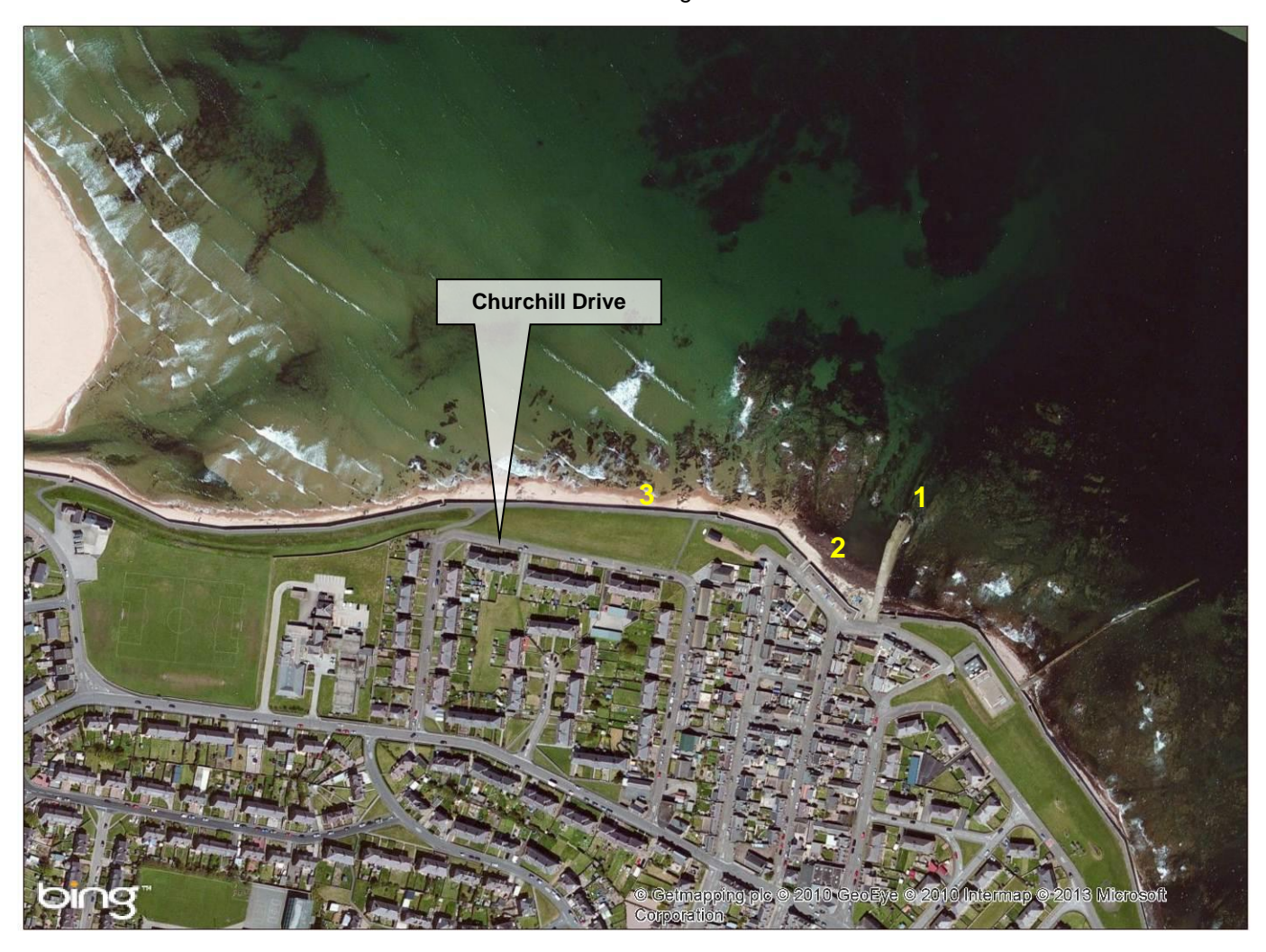
Figure 5: Landfall Site 1 – numbers refer to photos

An aerial photograph of Site 1 is shown in Figure 5 below. Note this site may not be considered feasible due to local fisherman concerns and local recreational amenities being close to the foreshore.