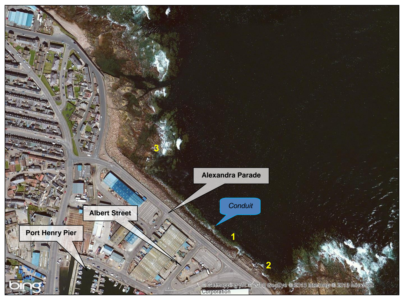
Figure 7: Landfall Site 3 - numbers refer to photos

An aerial photograph of Site 3 is shown in below. Note this site may not be considered feasible due to consenting issues.