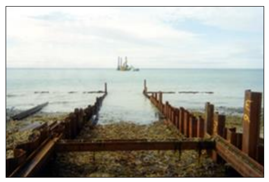
Figure 3: Example of a sheet piled cofferdam often used for cable pull operations at landfalls

The depth of excavation is dependent on site morphology and coastal processes, and that the open trench will be able to remain stable and 'open' long enough to achieve the cable installation before burial. If site conditions do not allow this then temporary trench support is required, usually in the form of steel sheet piling for cofferdam construction (see Figure 3). These are often require a burial depth of up to 3.0m below lowest expected beach level, to take into account long-term variations in beach profiles and in consideration of the security of the cable.