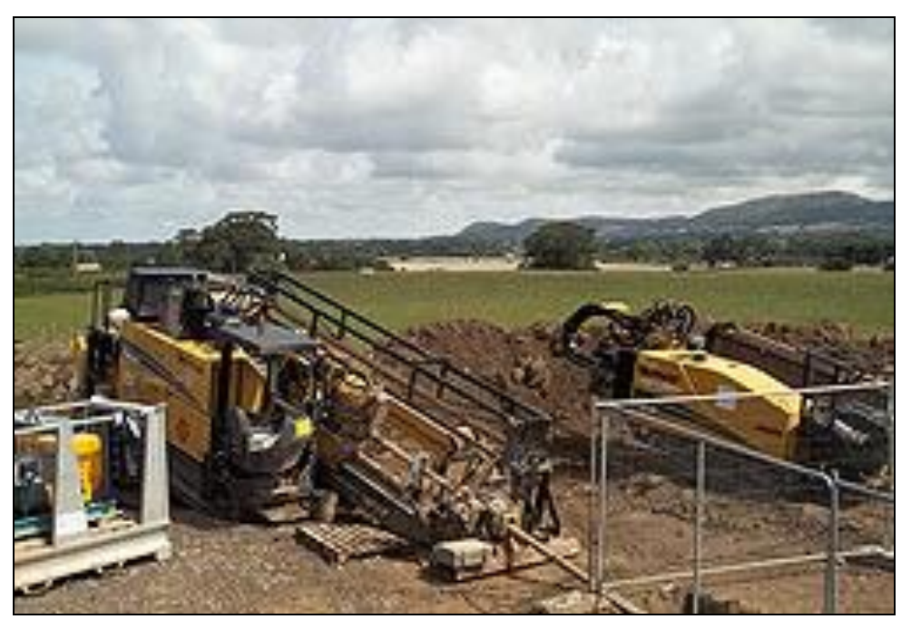
Figure 8: Typical short/long HDD drilling tools (Land and Marine Ltd).