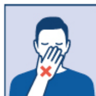
Avoid touching your face.