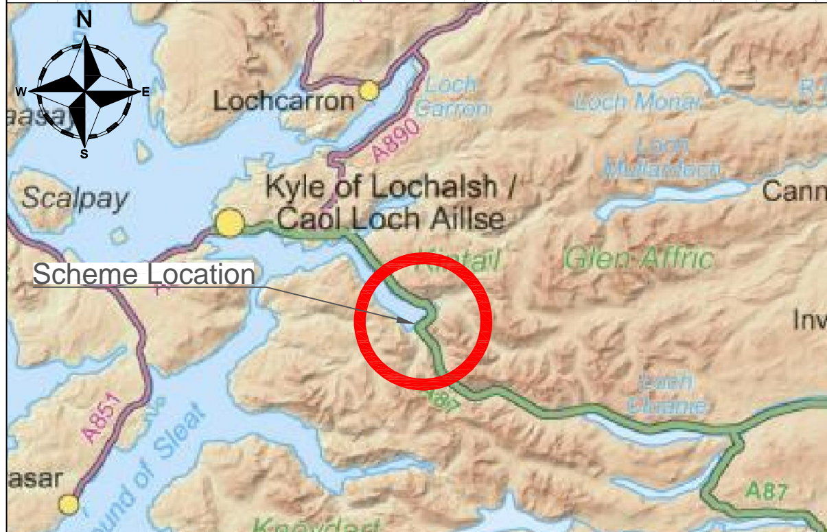
General Area Plan- NTS

Reproduced by permission of Ordnance Survey on behalf of HMSO. © Crown Copyright and database right 2018. All rights reserved. Ordnance Survey License Number: 100046668