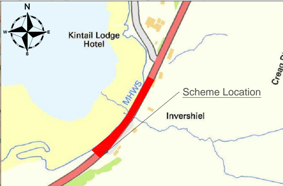
Local Area Plan- NTS