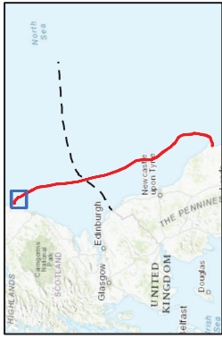
Figure 1 The EGL2 Marine Scheme, for MLA submission to MS LOT - Within 12NM